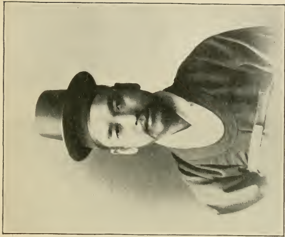
YI PÖM CHIN (CHIN POM YE).

H. I. KOREAN MAJESTY'S MINISTER TO THE UNITED STATES.