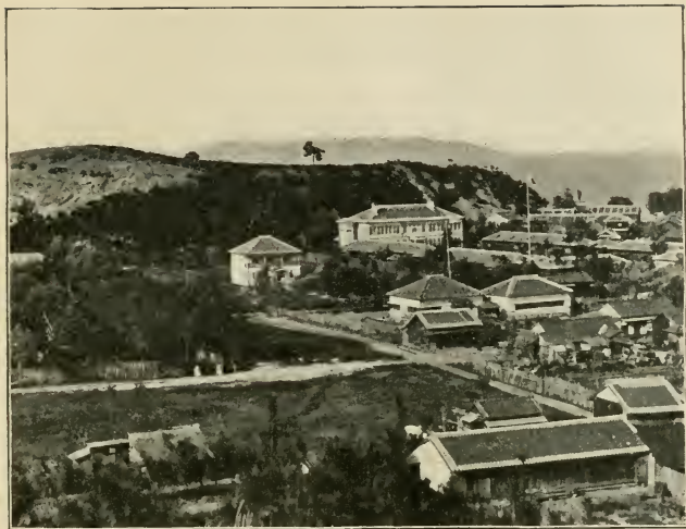
WONSAN, JAPANESE SETTLEMENT.