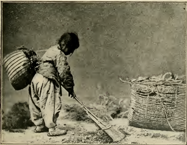
THE HOPE OF THE NATION.