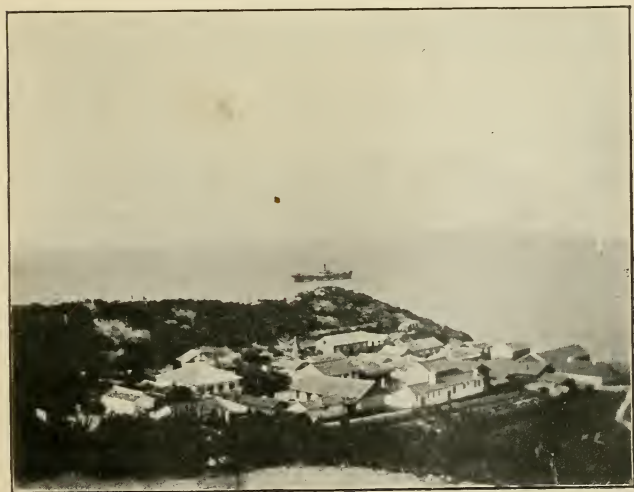
WONSAN, CHINESE SETTLEMENT.