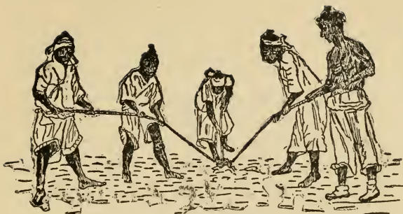
ALL AT ONE SHOVEL