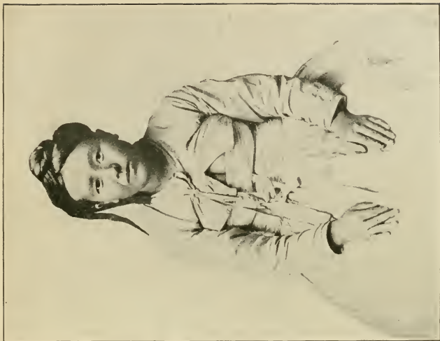
THE COOLIE'S WIFE.