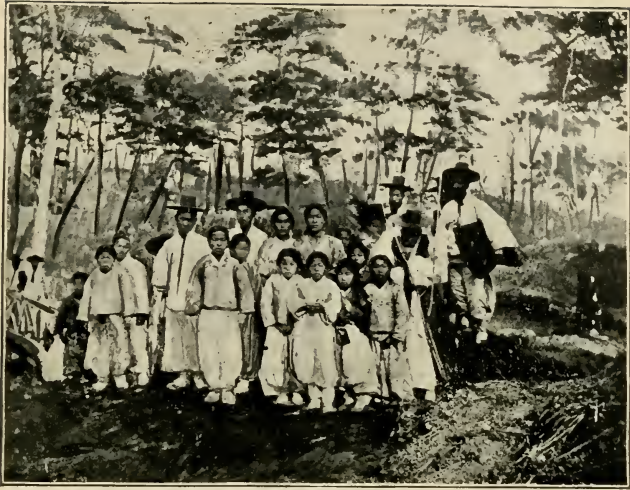
SOME OF THE INHABITANTS.