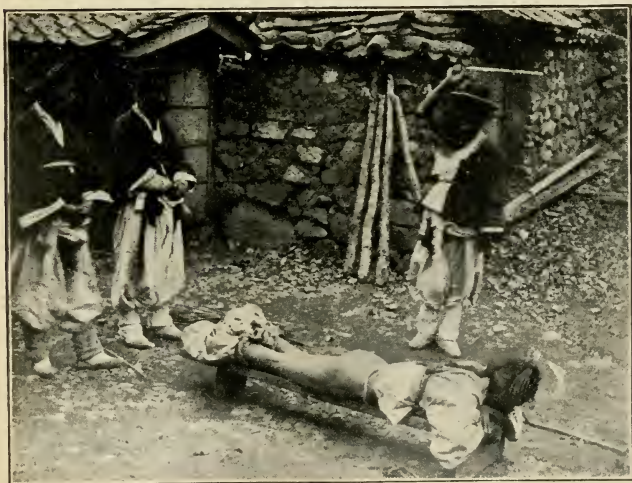
ACCORDING TO LAW.