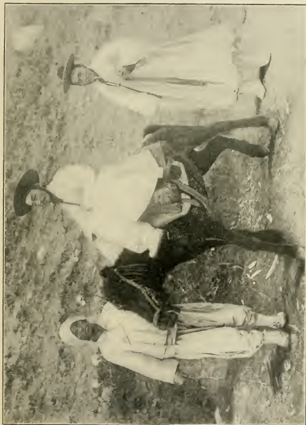
THE KOREAN PONY.