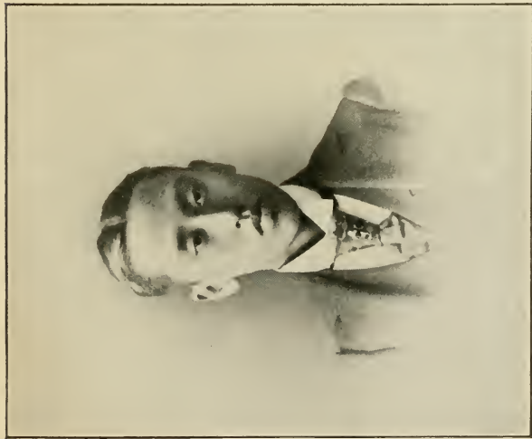
H. H. PRINCE EUI WHA.