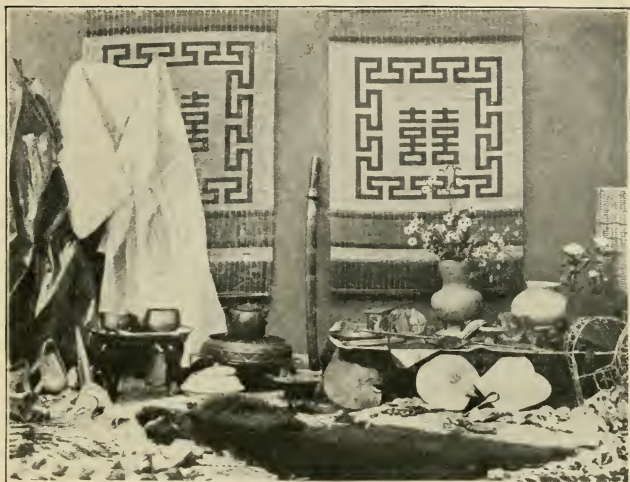
THE WARDROBE OF THE GENTRY.