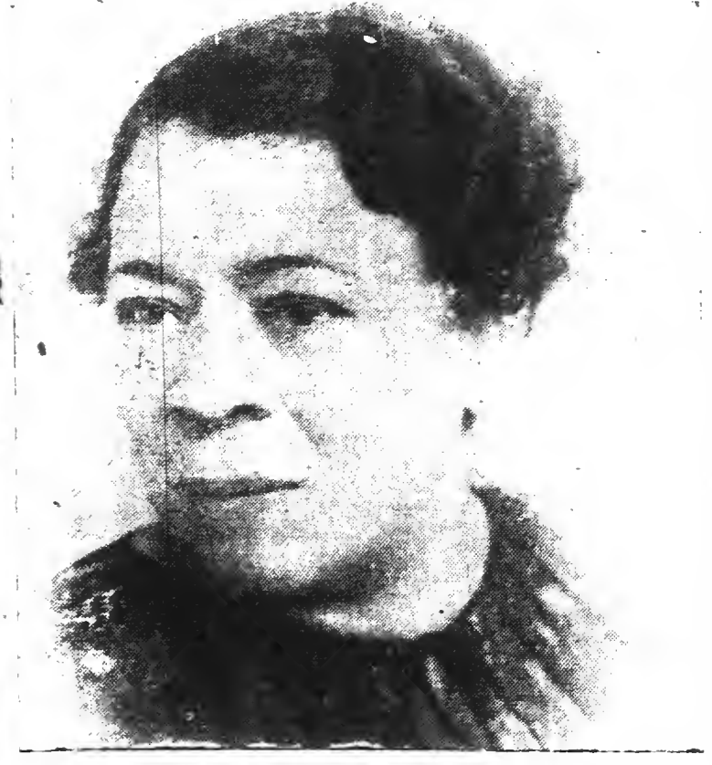
MEETS WITH UNFORTUNATE ACCIDENT