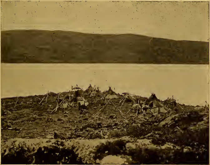
BARREN GROUND LAKE, TSHINUTIVISH, 1906