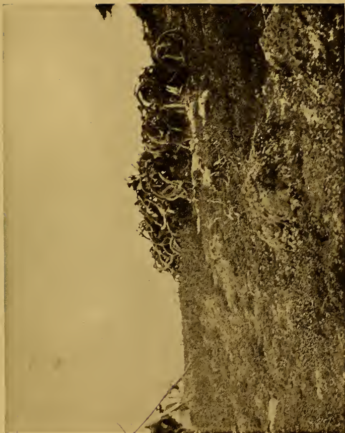
A WINDROW OF HORNS