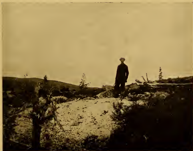
CRUSHED MARROWBONES FROM PERHAPS A THOUSAND DEER