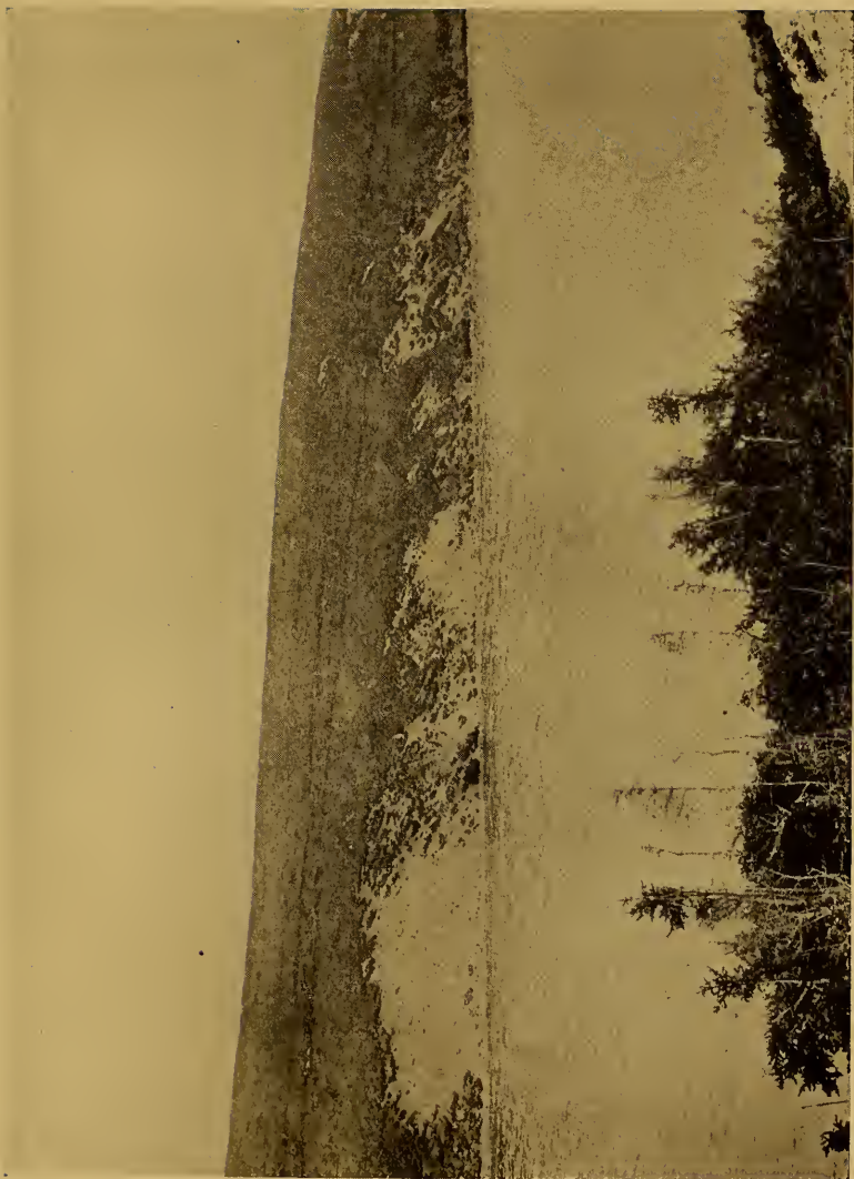
WHITE MOSS SLOPES WITH CARIBOU PATHS, MISTINIPI