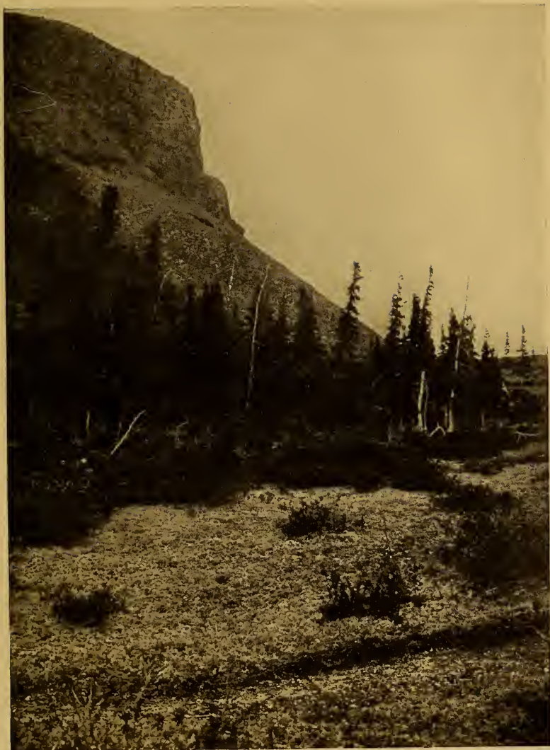
A GAME PASS. BEAR AND CARIBOU PATH AT MISTASTIN HEADLAND