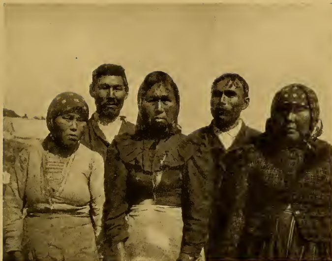
AT RED POINT