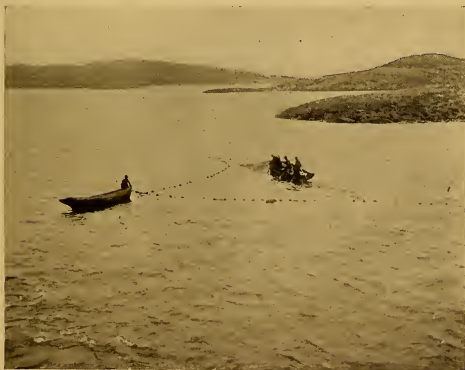
HAULING A TRAP