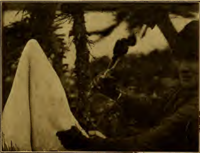
FLESHING A DEERSKIN WITH DOUBLE LEG BONE OF A DEER