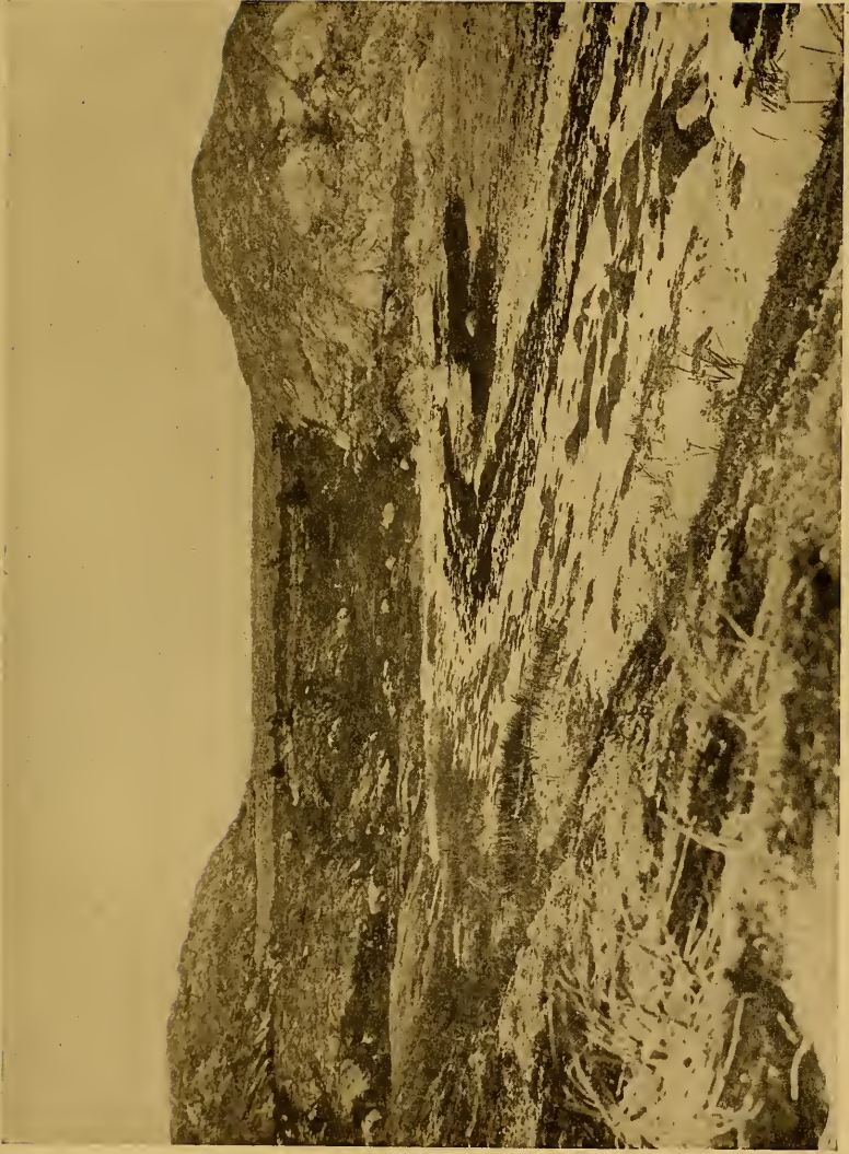
A RAISED BEACH