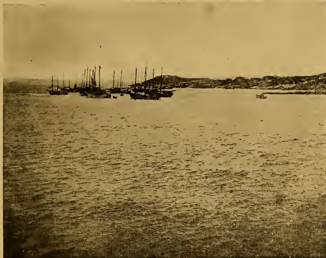
WAITING FOR FISH