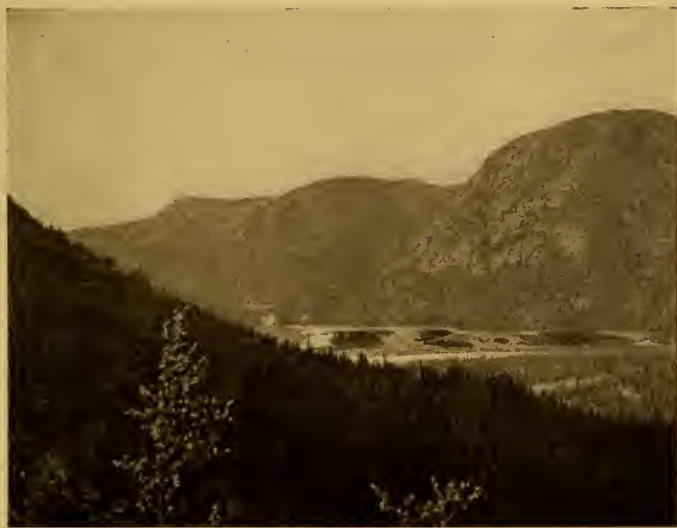
FROM THE HIGH PORTAGE