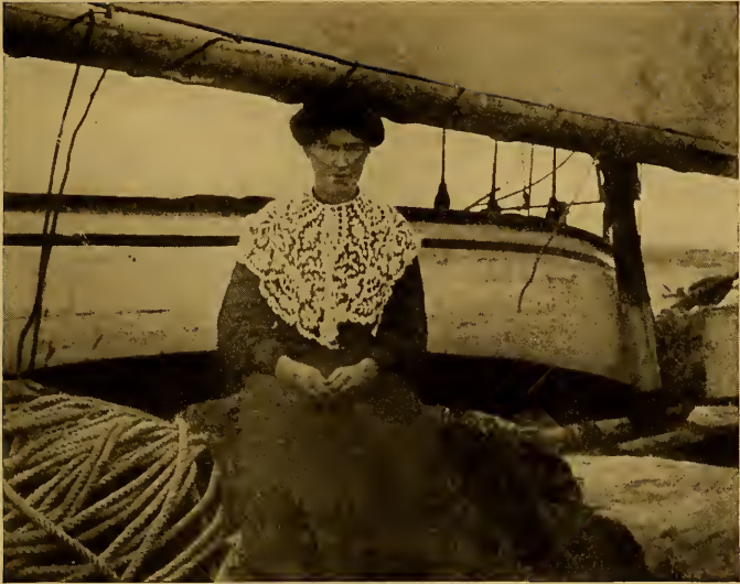
THE COOK OF THE CAMBRIA