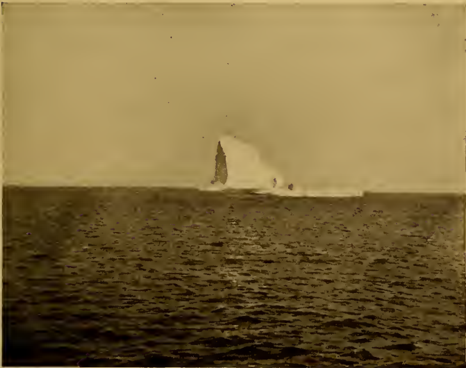
A SMALL BERG