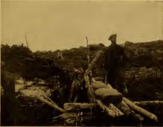
A DEAD FALL, MISTINIPI, 1910