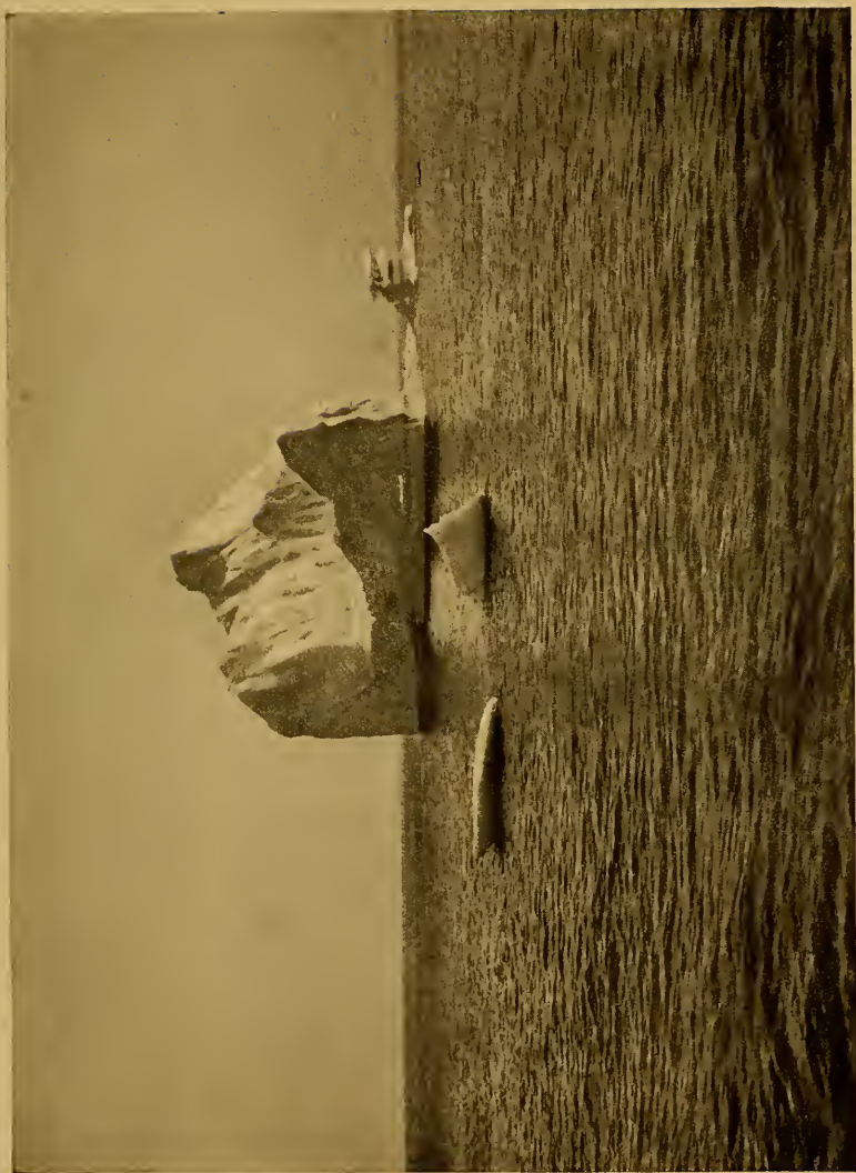
OFF BATTLE HARBOR