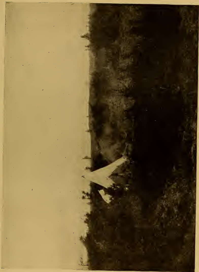
A WINDY CAMP