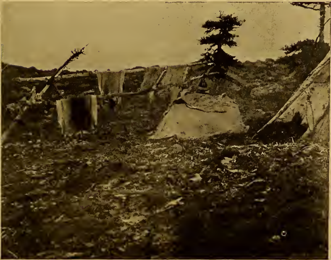
HAIR SKINS, MISTINIPI, 1906