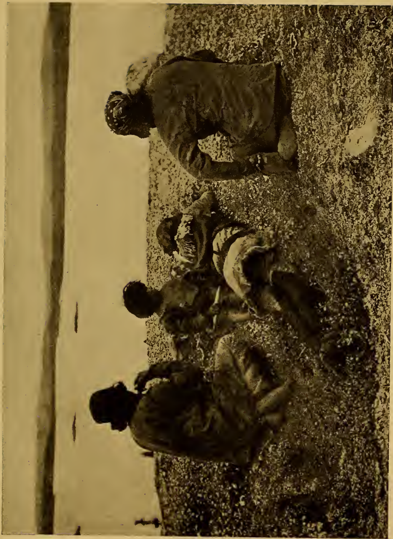
WATCHING THE CARIBOU. LOOKOUT AND DEER CROSSING AT MISTINIPL. NAH-PAY-O HAS A SMALL SPY GLASS