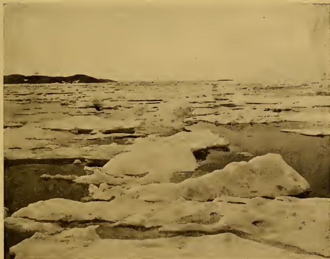
THE BEGINNING OF THE PACK, CAPE HARRIGAN, 1905