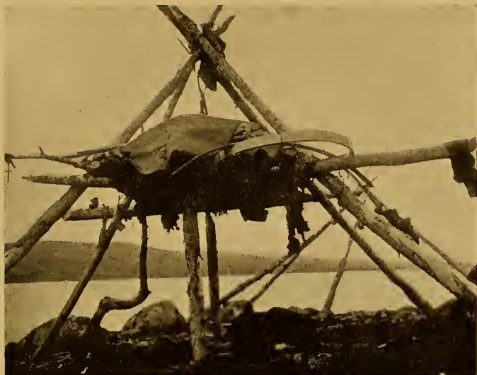
A FOOD SCAFFOLD