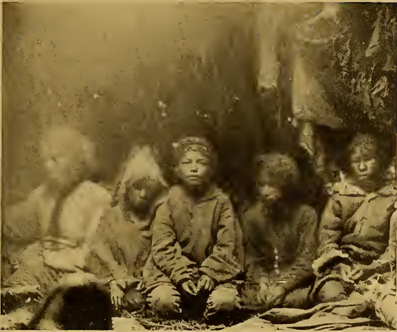
IN A TSHINUTIVISH LODGE