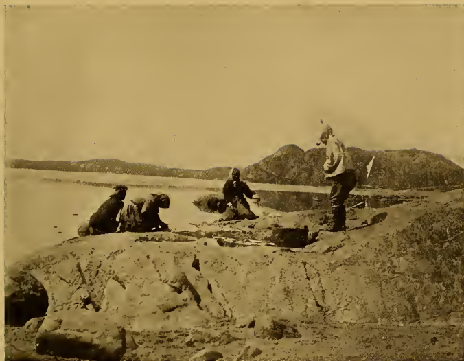
THE NOAHS SPLITTING FISH, TUHPUNGIUK IN BACKGROUND