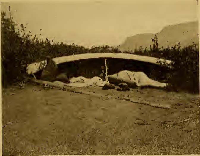
A GOOD ROOF