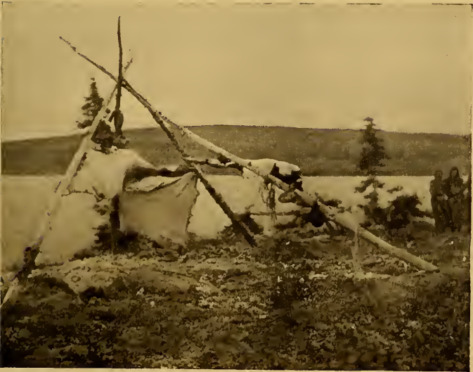
HAIR SKINS DRYING, MISTINIPI, 1906