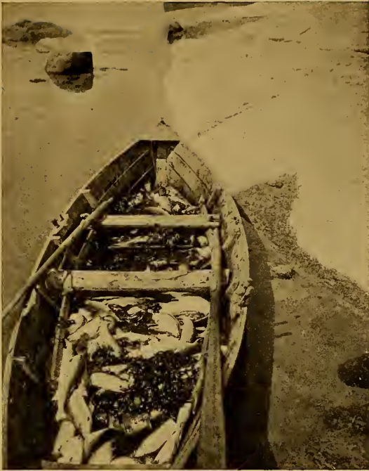
SEA TROUT AT UN'SEKAT