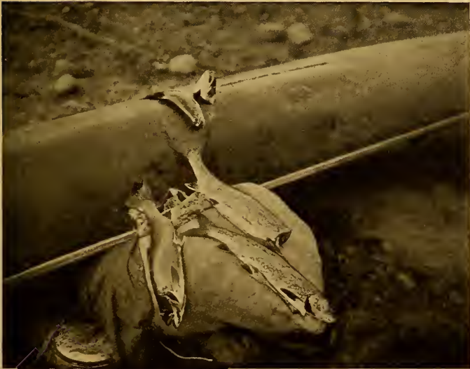
SQUARETAIL AND LAKE TROUT, ASSIWABAN RIVER, 1906