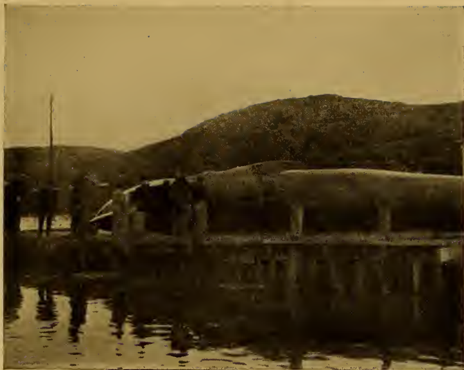
A FINBACK, HAWK HARBOR