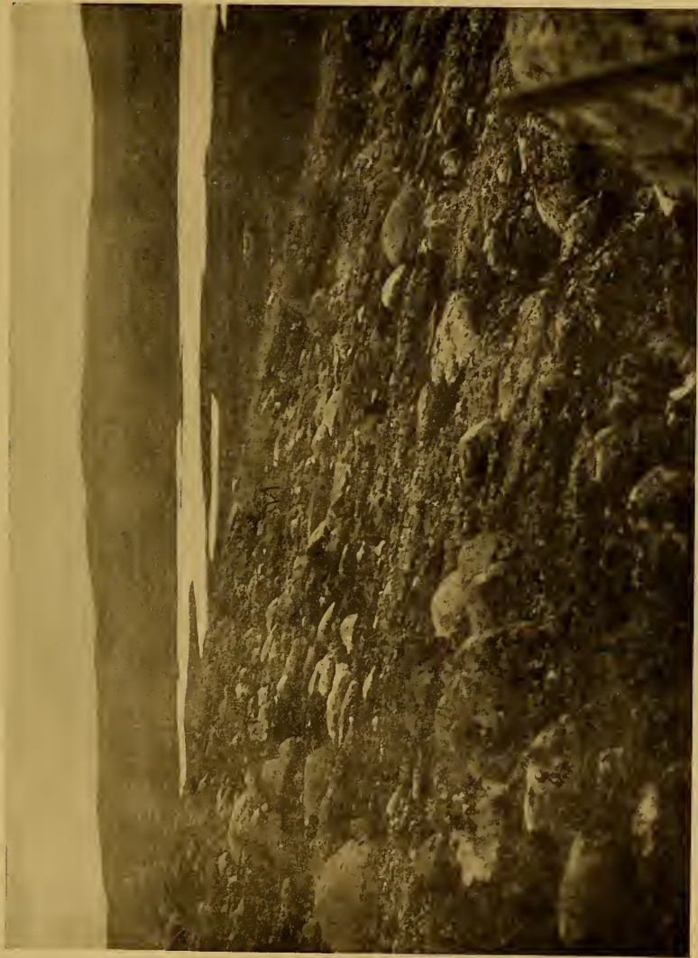
LONG POND, FROM CARIBOU HILL, THE CARIBOU DARKENED FOR CONTRAST