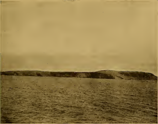
THE CAPE RACE COAST