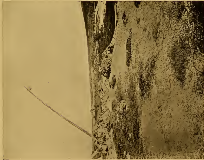
AN INDIAN OFFERING. BEAR'S SKULL ON POLE