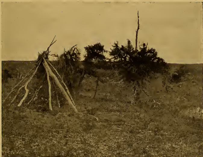
INDIAN CAMP IN THE BARRENS