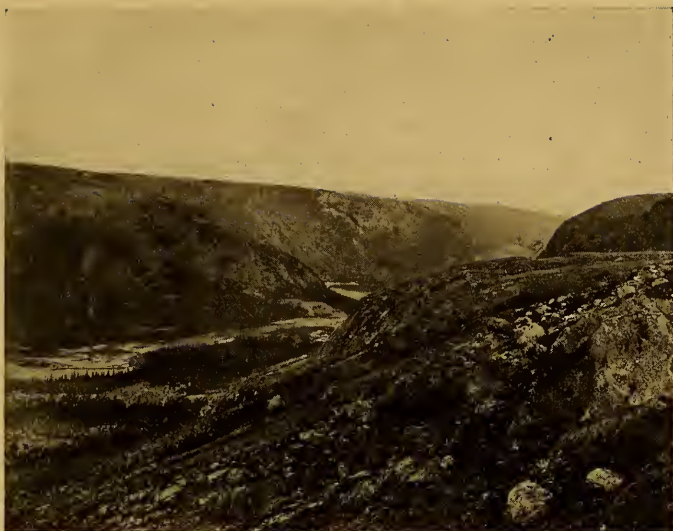
ASSIWABAN RIVER, FROM WEST OF HIGH PORTAGE