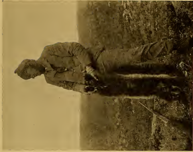
WOLVERENE, UNDER SIDE