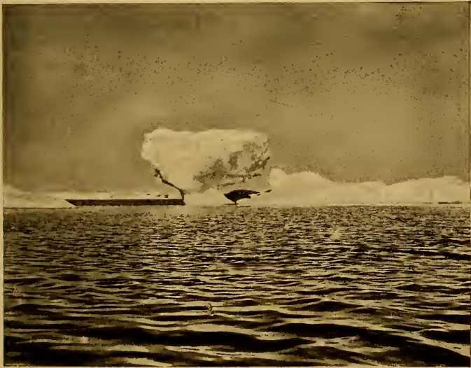
UNDERCUT ICE, FANNY'S HARBOR, JULY 22