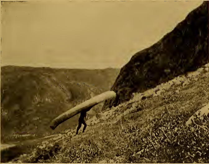
ON THE HIGH PORTAGE. THE STEEPER PART IS BELOW