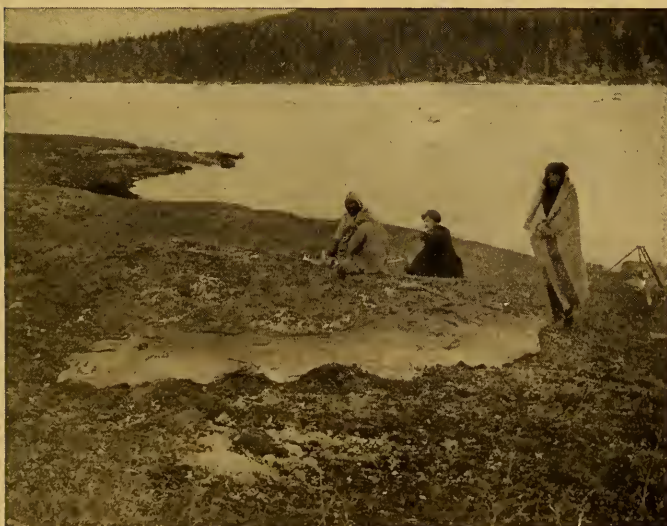
A TRAVELING TENT