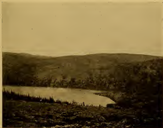
THE WHITE MOSS HILLS, NEAR MISTINIPI