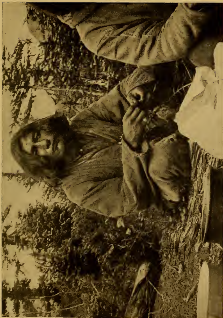
ON THE ASSIWABAN