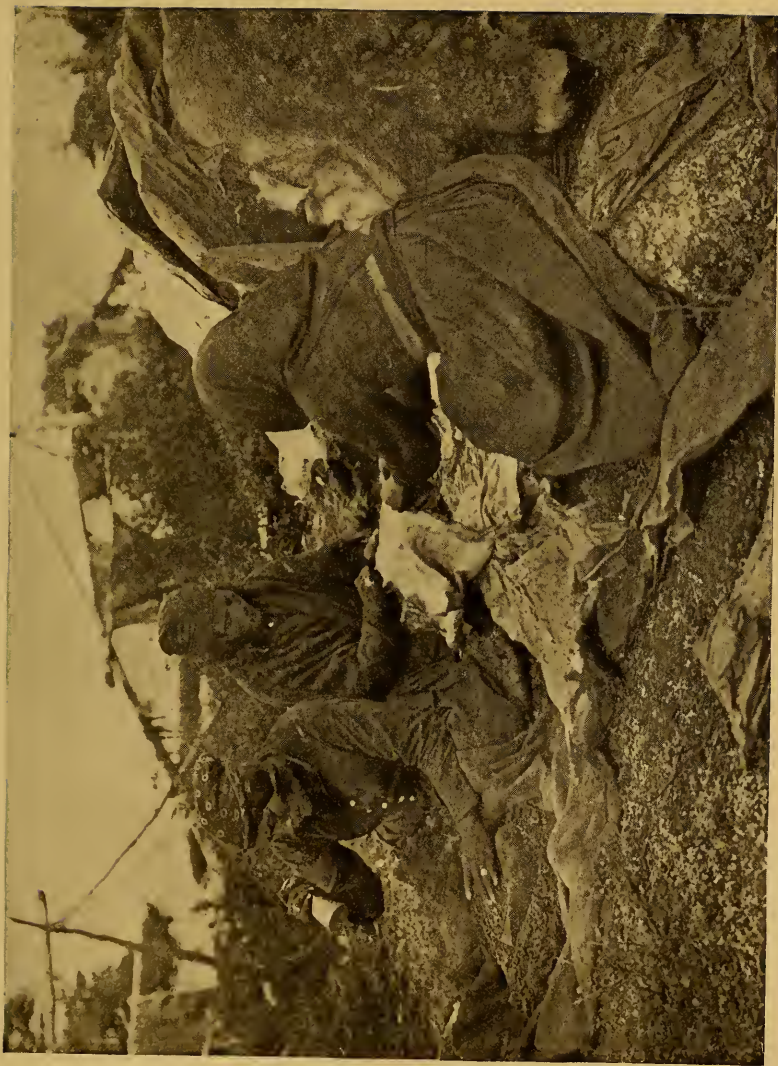
MAKING PEMMICAN AND WORKING SKINS, MISTINIPI