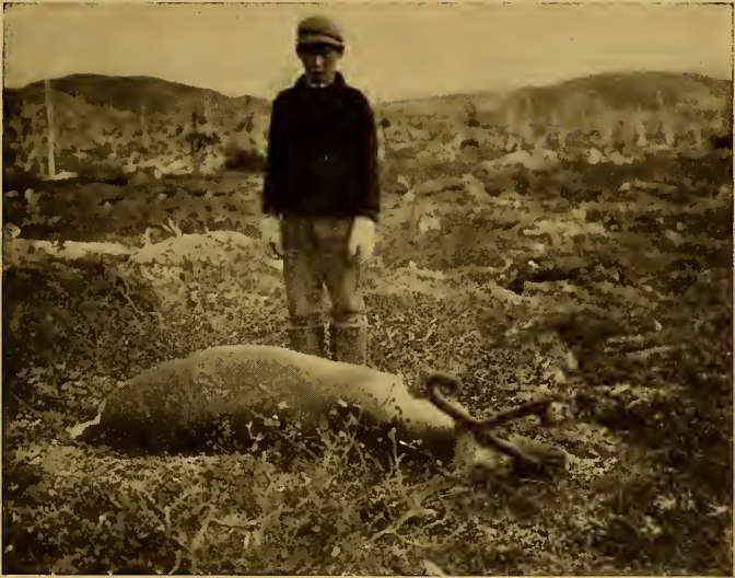
ENOUGH FOR A CACHE