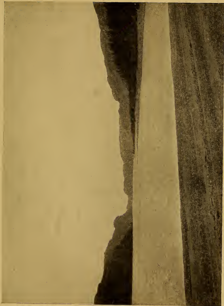
THE WIND LAKE OF THE ASSIWABAN, CABOT LAKE