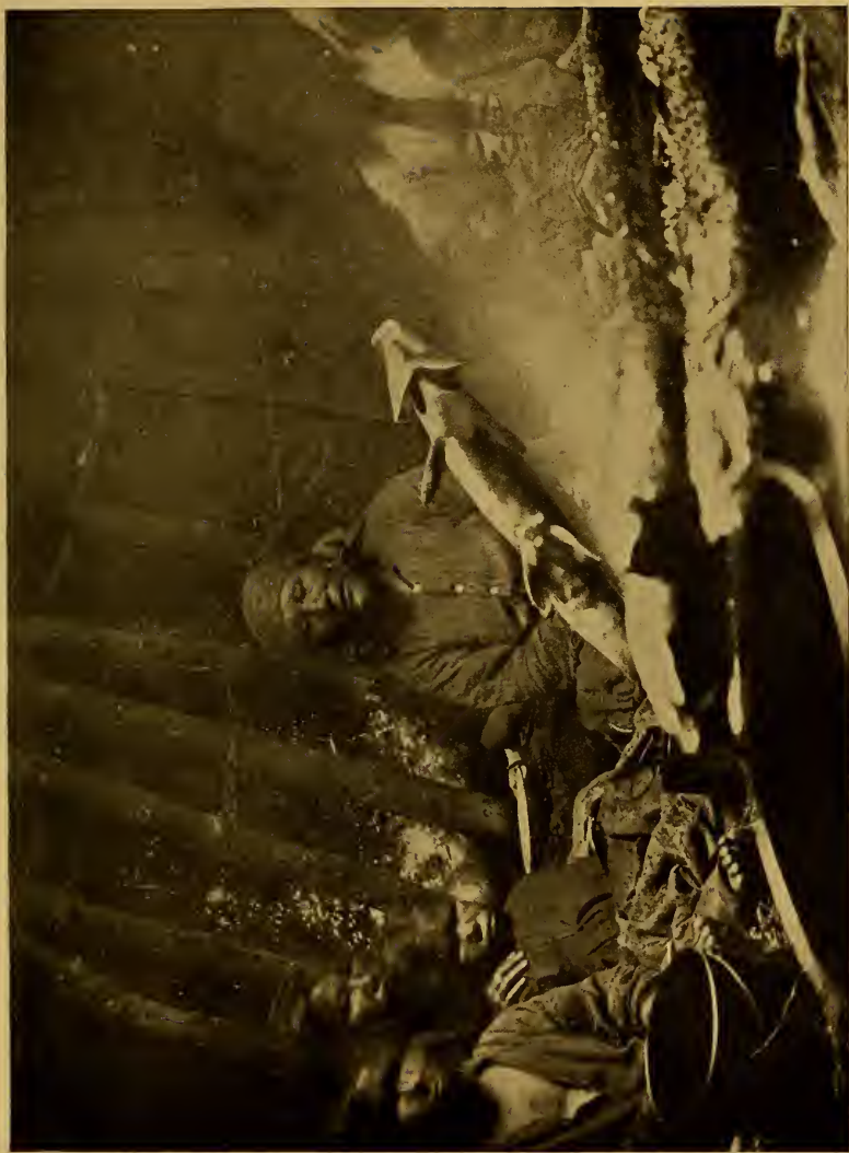
A TSHINUTIVISH LODGE. BROILING A WHITEFISH