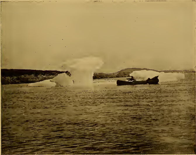
OVERTURNING ICE, NEAR VOISEY'S BAY, 1905