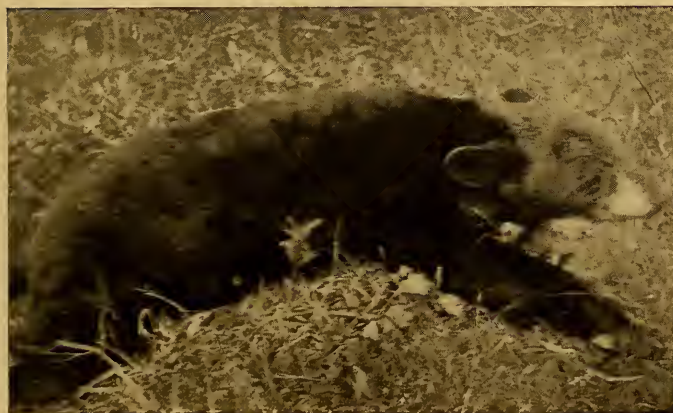
A BEAR, BEAR POND, 1905