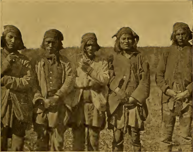
AT DAVIS INLET