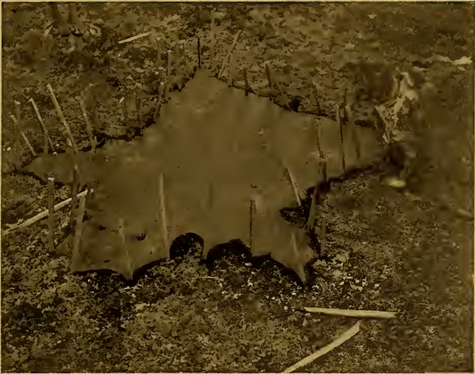
A MISTINIPI BEARSKIN