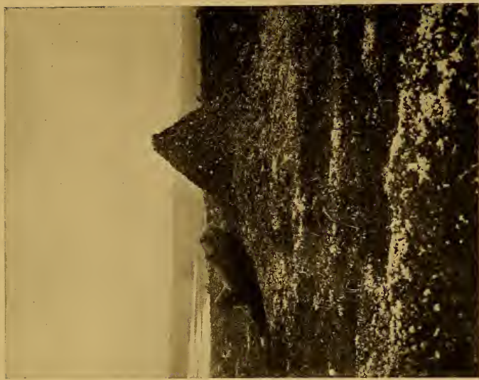
A WEATHERED BOULDER, MISTASTIN LAKE