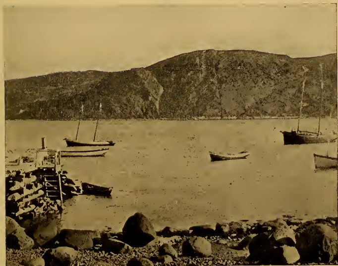
LOOKING ACROSS DAVIS INLET