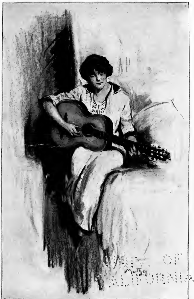
It was a love song of old Spain