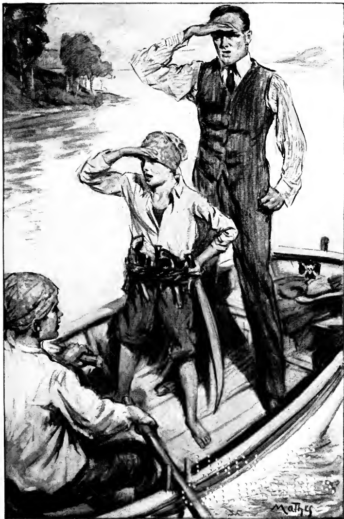
I, too, stood, shading my eyes with my hand