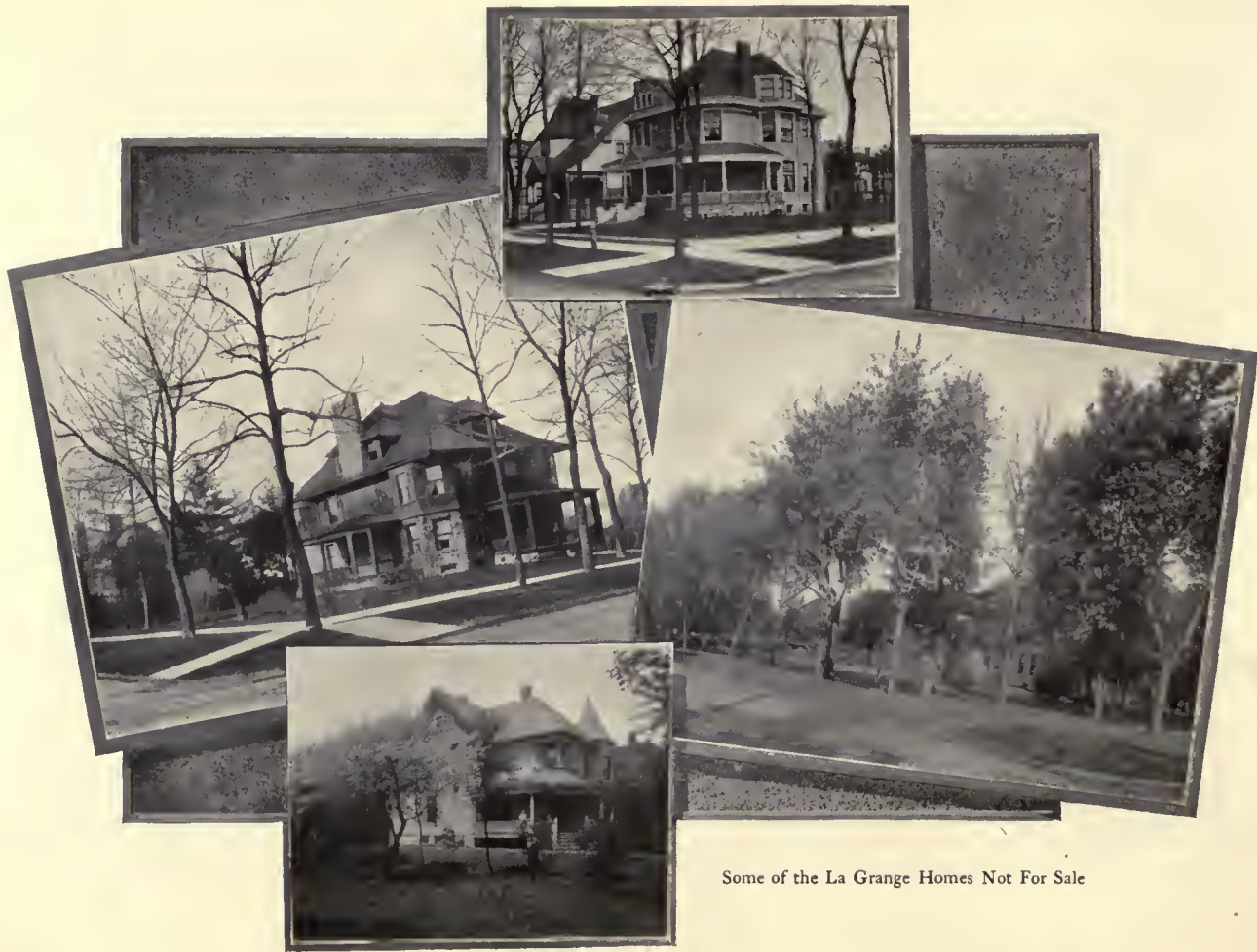
Some of the La Grange Homes Not For Sale