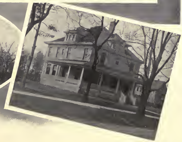
Some of the La Grange Homes Not For Sale