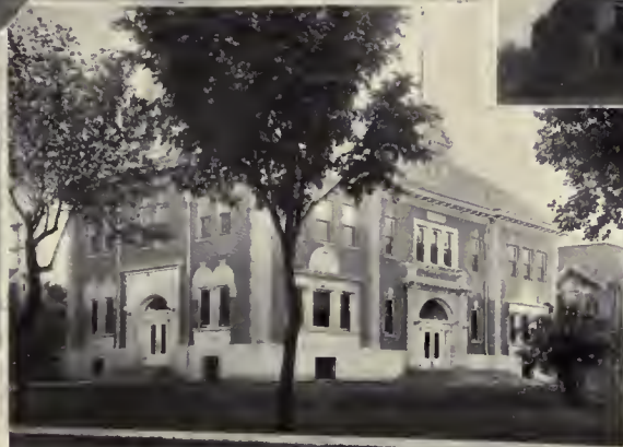
La Grange Town Hall