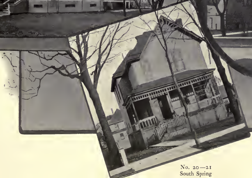
No. 20—21 South Spring