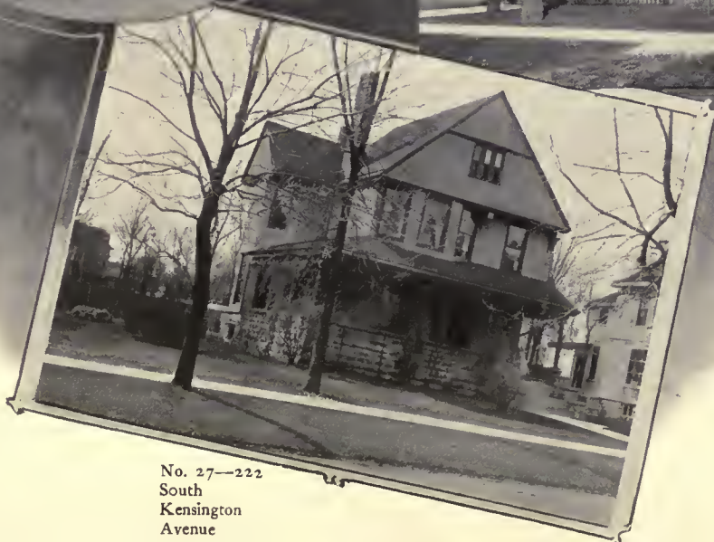
No. 27—222 South Kensington Avenue