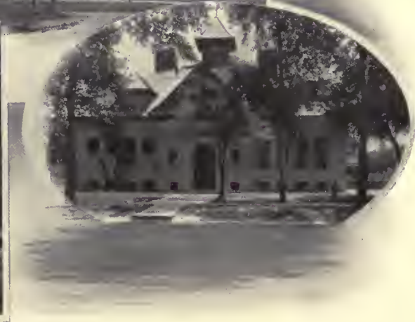
The North Side Grammar School