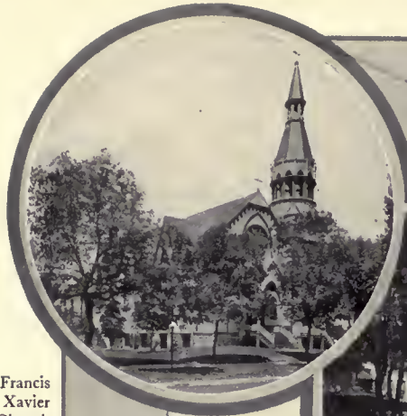
St. Francis Xavier Church