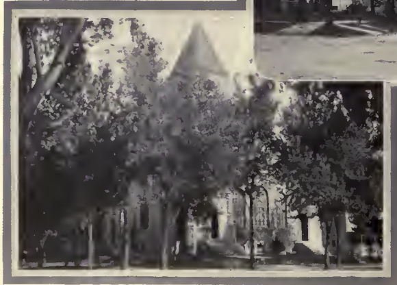
First Congregational Church