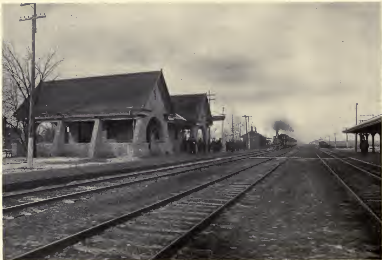
The office is opposite this station