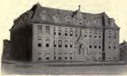
Nazareth Academy "Chateau Loyola"