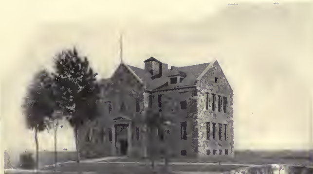
The East End Grammar School