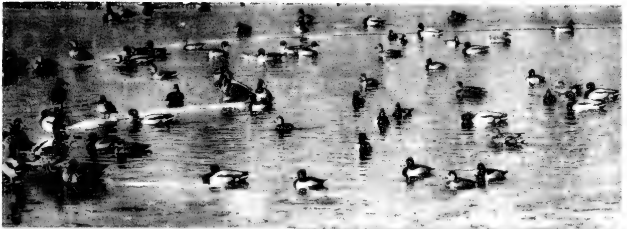
Above--Spring thaws bring mallards, black ducks, pintails, lesser scaups, ring-necked ducks, American widgeons, gadwalls, and other ducks to Fork Lake.