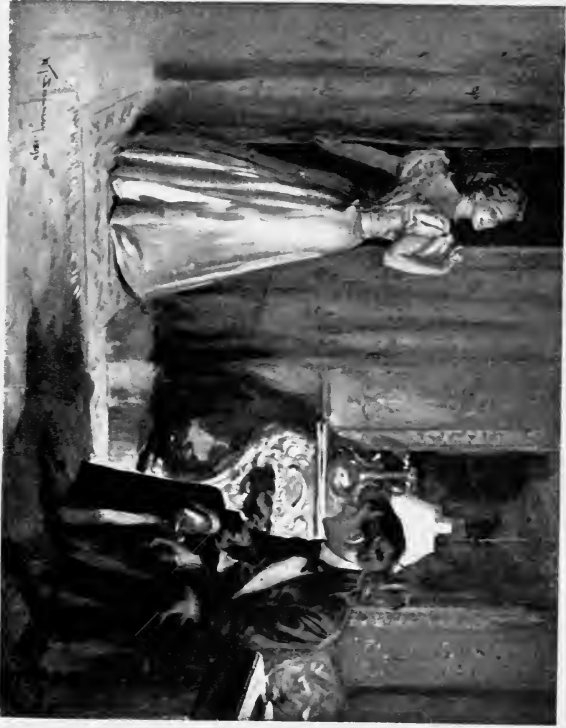
“NO MORE JAYS FOR ME, NO MORE JACS FOR YOU”