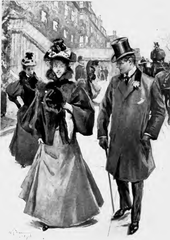
“ HE CONTRIVED TO GO WITH HER ”