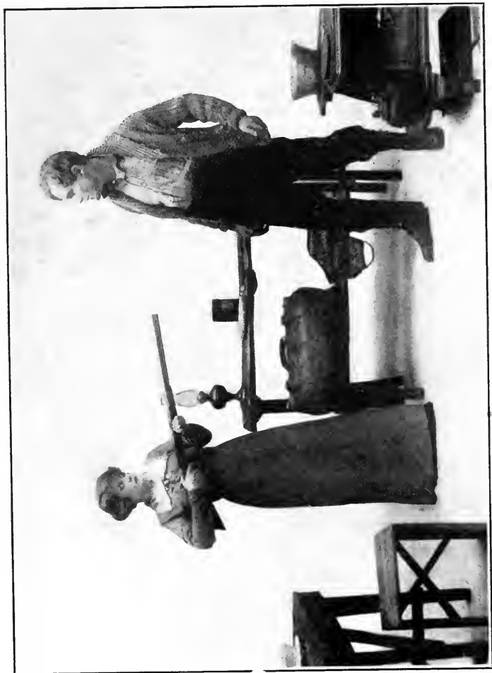
"I'll shoor you, I'll shoor you!"