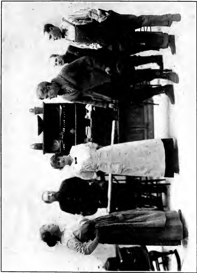
"I'M SORRY I WAS RUDE TO YOU, GERTIE."