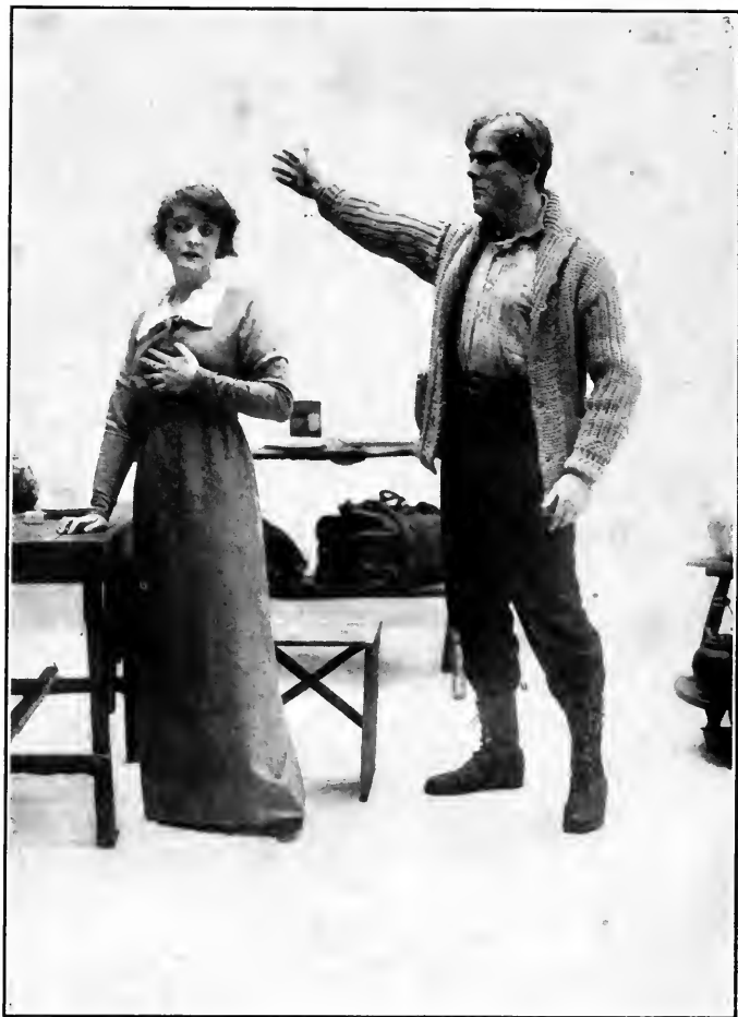
"CAN'T YOU HEAR IT, THE SILENCE OF THE PRAIRIE?"