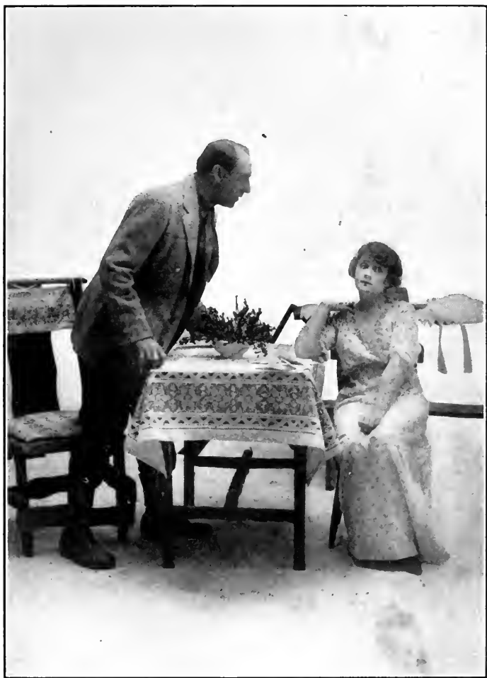
"NORA, FOR GOODNESS' SAKE, TELL ME IF THERE'S ANYTHING THE MATTER."