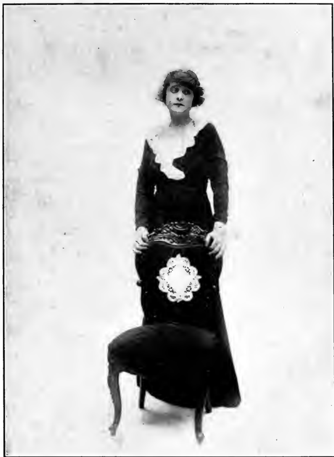
NORA MADE NO REPLY TO THIS AFFABLE SPEECH.