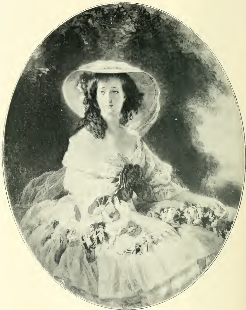
The Empress Eugénie. From Painting by Winterhalter.