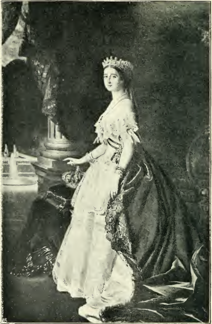
The Empress Eugénie. From Painting by Winterhalter.