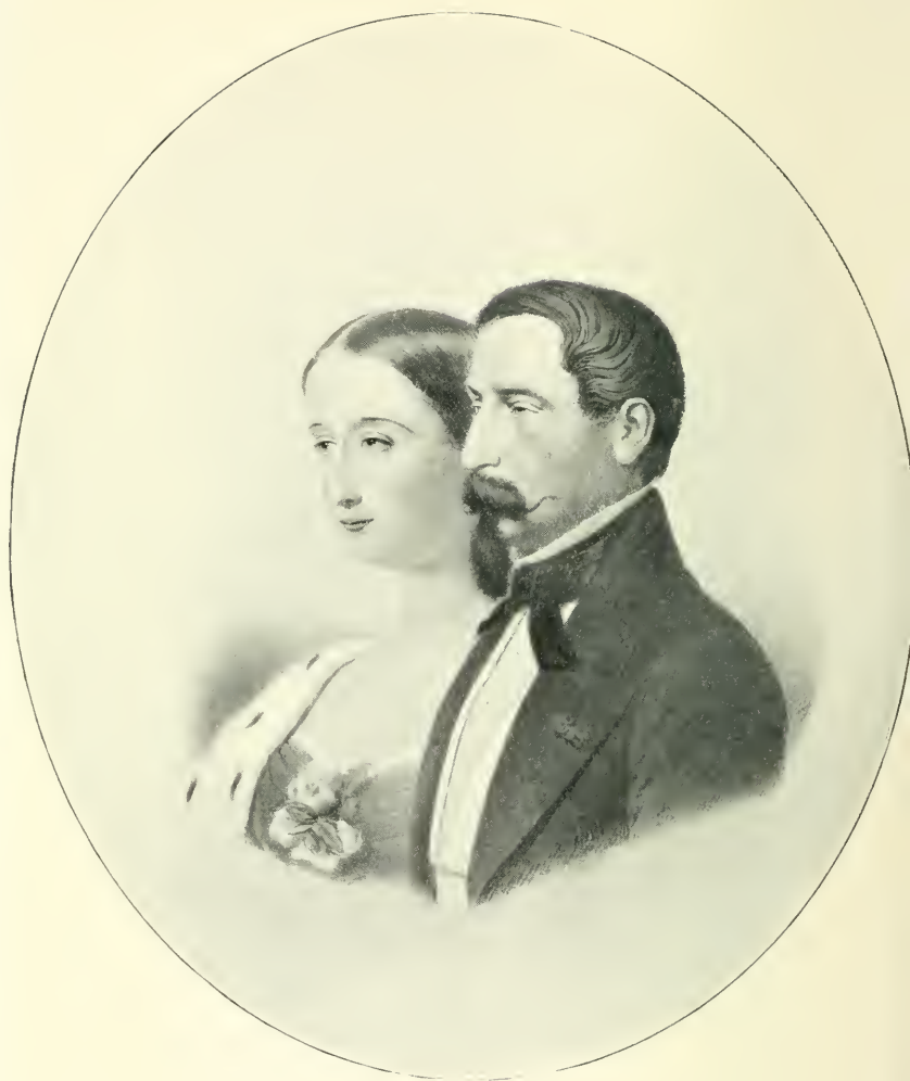
Napoleon and Eugénie.

From coloured lithograph by Alophe, 1855.