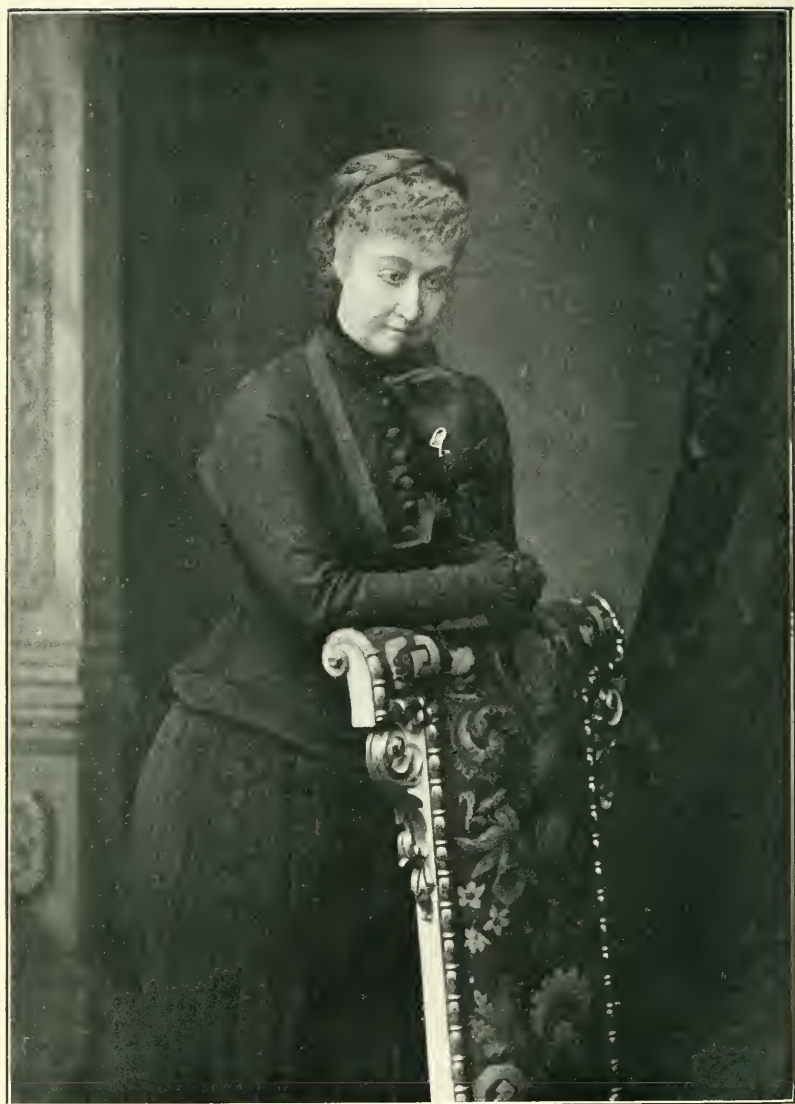
The Empress in later life.