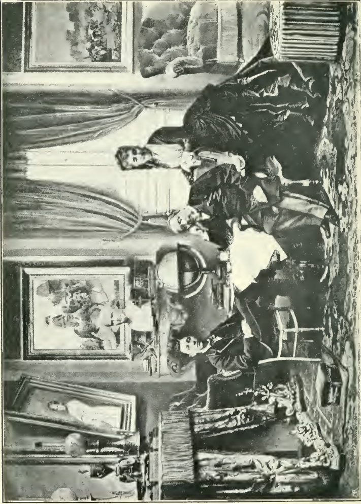
The Emperor, Empress, and Prince Imperial at Chislehurst,