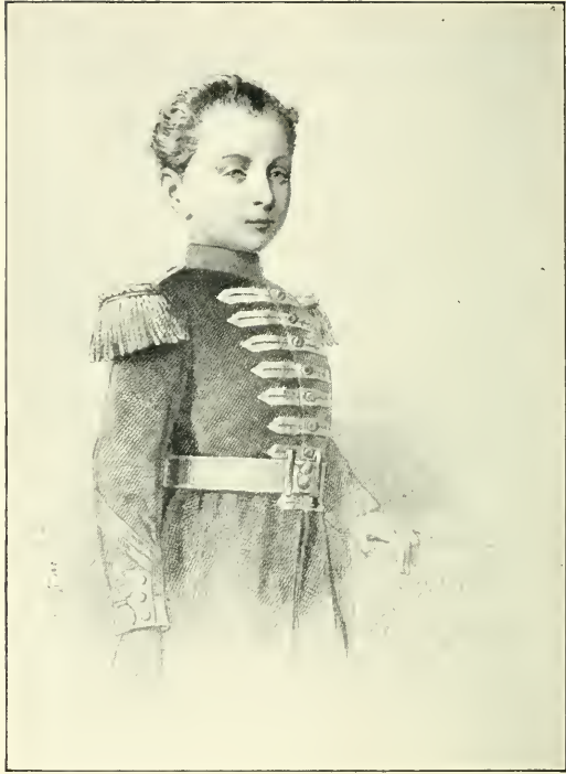
The Prince Imperial.