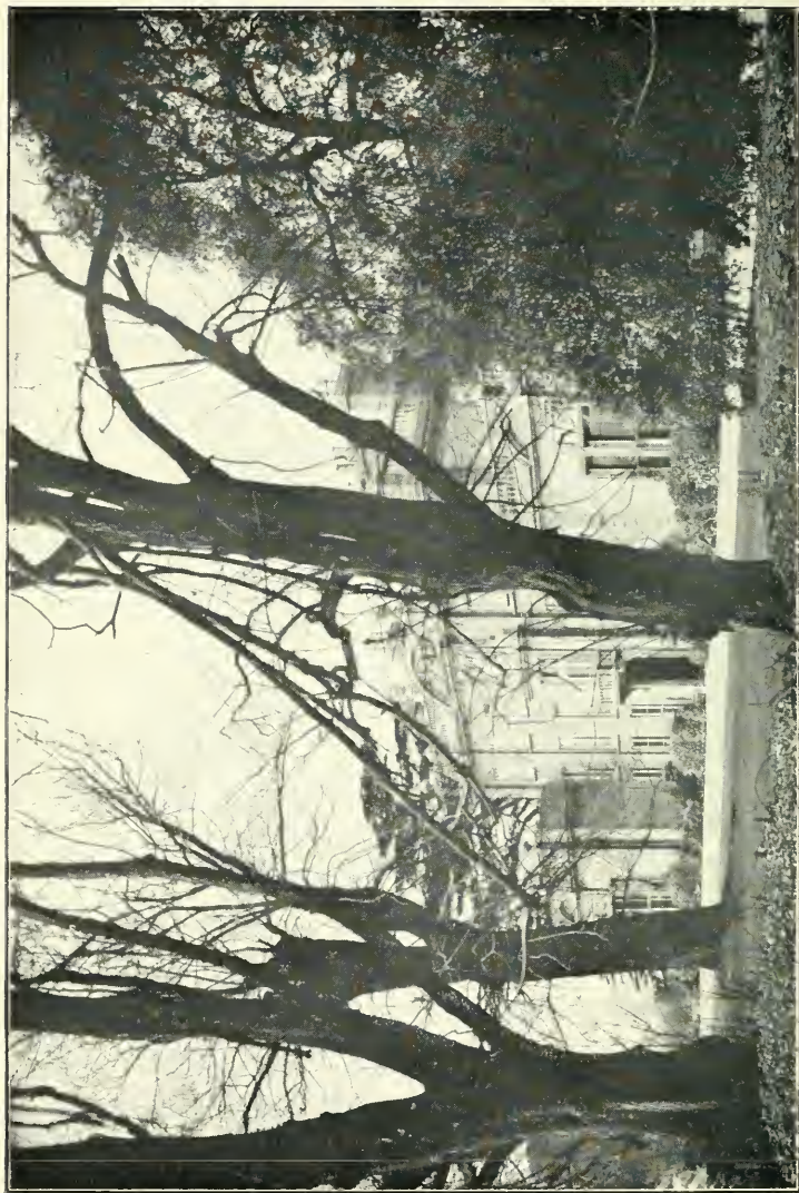
Camden Place, Chislehurst.