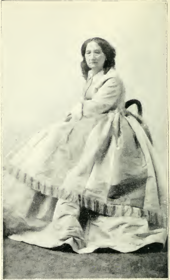
Countess of Montijo.