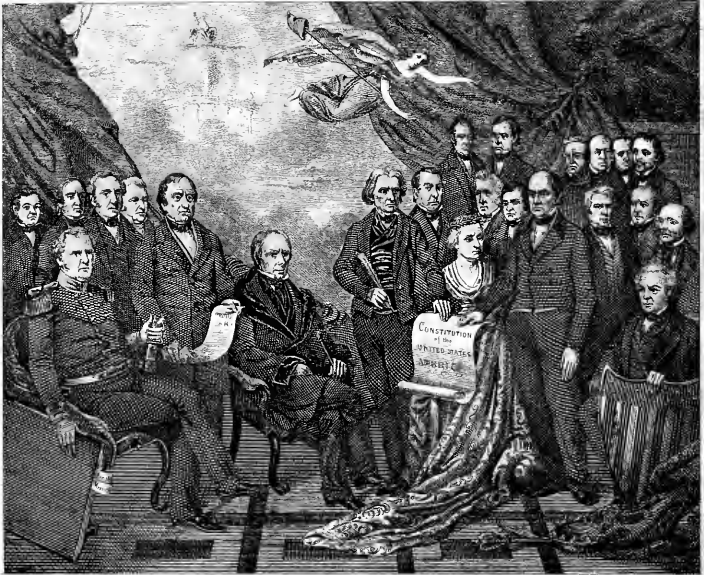
Ferd. Meyer & Co. 96 Fulton St. cor. William N.Y.