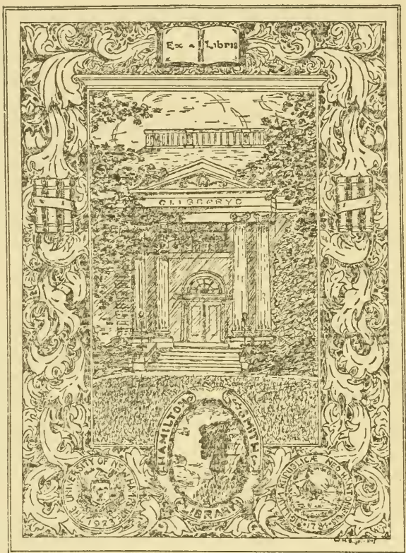
Gift of New Hampshire