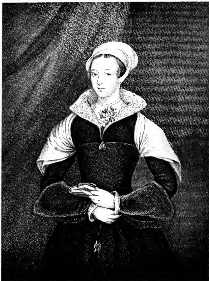
LADY JANE GREY

From an engraving in Edmund Lodge's Portraits of Illustrious Personages of Great Britain London, 1823, Vol. II