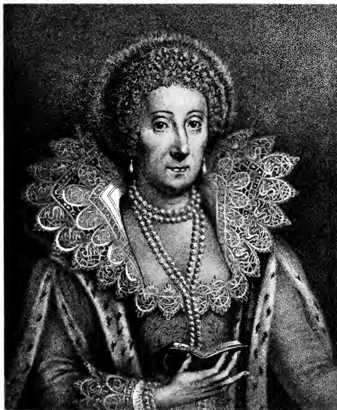
MARY SIDNEY, COUNTESS OF PEMBROKE

From an engraving in Horace Walpole's Royal and Noble Authors , London, 1806