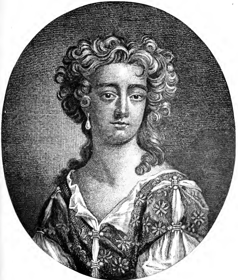
MRS. ANNE KILLIGREW

From a painting by herself