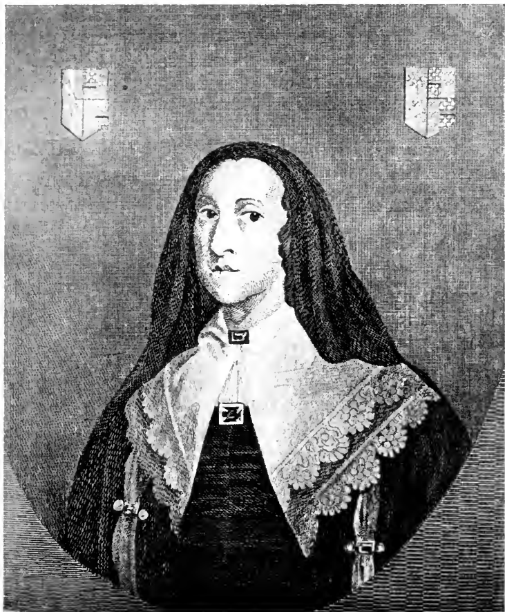
ANNE CLIFFORD, COUNTESS OF DORSET, PEMBROKE AND MONTGOMERY

From an engraving in Pennant's Tour in Scotland , 1790, Part II