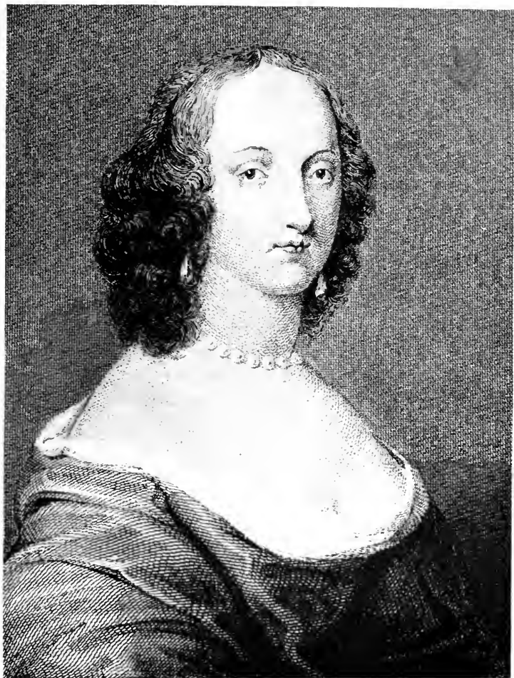
MRS. KATHERINE PHILIPS