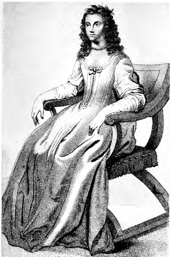
MARGARET CAVENDISH, DUCHESS OF NEWCASTLE

From an engraving in Horace Walpole's Royal and Noble Authors , London, 1806