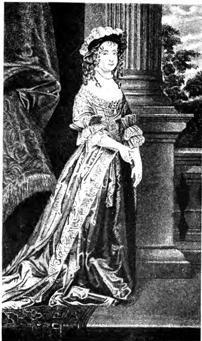
MARGARET CAVENDISH, DUCHESS OF NEWCASTLE

From an engraving in The Lives of William Cavendish, Duke of Newcastle, and of his wife Margaret, Duchess of Newcastle , edited by Mark Antony Lower, London, 1872