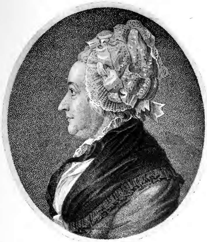
MISS ELIZABETH CARTER

From an engraving in The Works of Elizabeth Carter , 1806