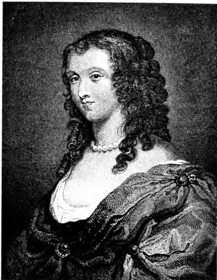
MRS. APHRA BEHN

From a picture by Mary Beale in the collection of his Grace the Duke of Buckingham Drawn by T. Uwins. Engraved by J. Fittler, A.R.A. From an engraving in Effigies Poeticae , London, 1824, Vol. II