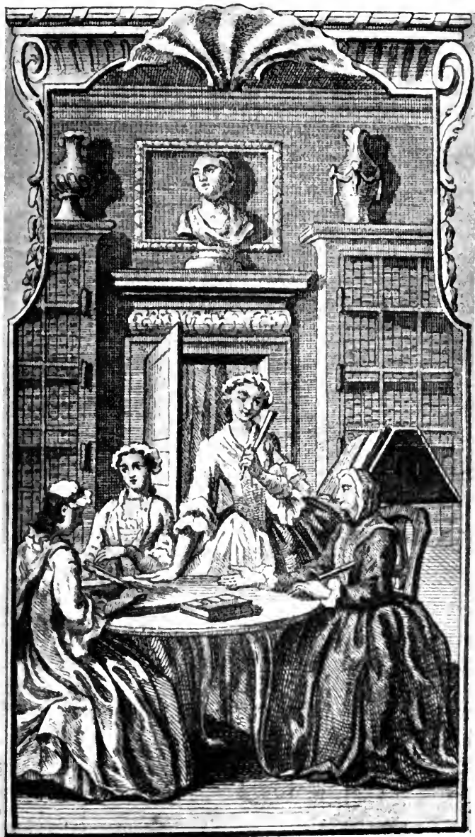
THE SUPPOSED EDITORS OF THE FEMALE SPECTATOR BY MRS. ELIZA HAYWOOD

From Vol. I of the seventh edition, 1771