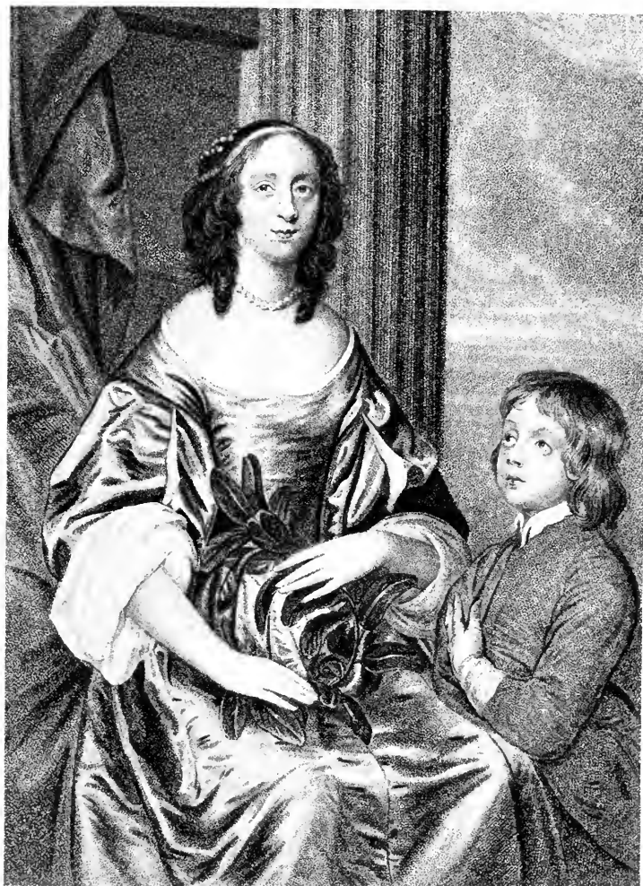
MRS. LUCY HUTCHINSON AND HER SON

From an engraving in Memoirs of the Life of Colonel Hutchinson , 1808