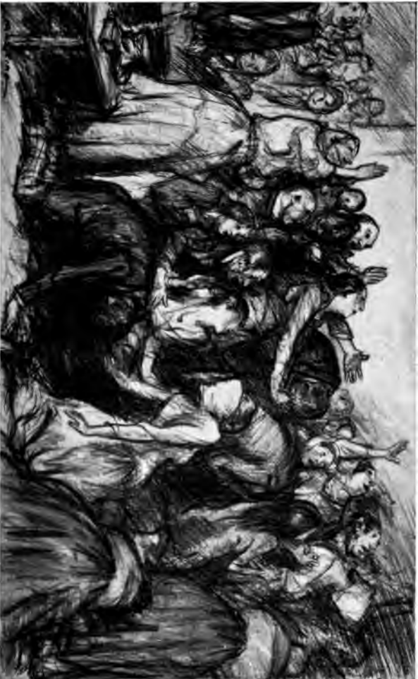
They swarmed forward to the altar-place and flung themselves on the ground, and heaped the pulpit-steps with their bodies