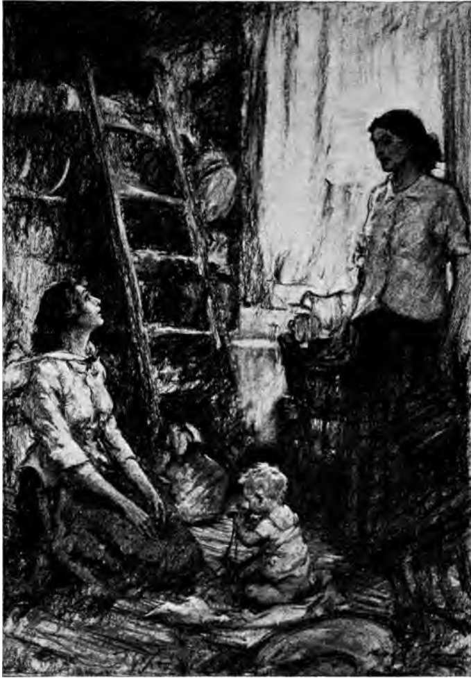
Nancy stood staring at her, with words beyond saying in her heart—words that rose in her throat and choked her