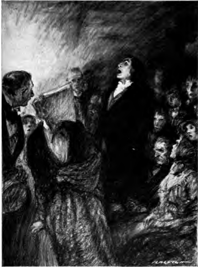
He was now towering over those near him, with his head thrown back, and his hair tossed like a mane on his shoulders