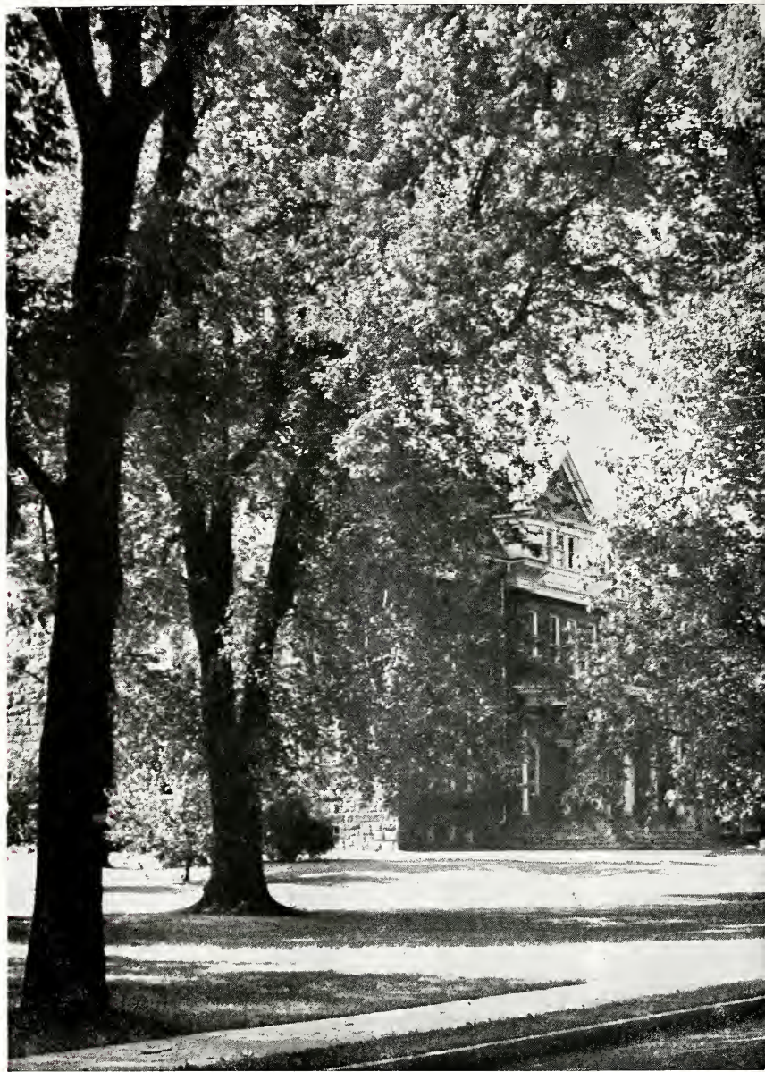
CONSERVATORY OF MUSIC