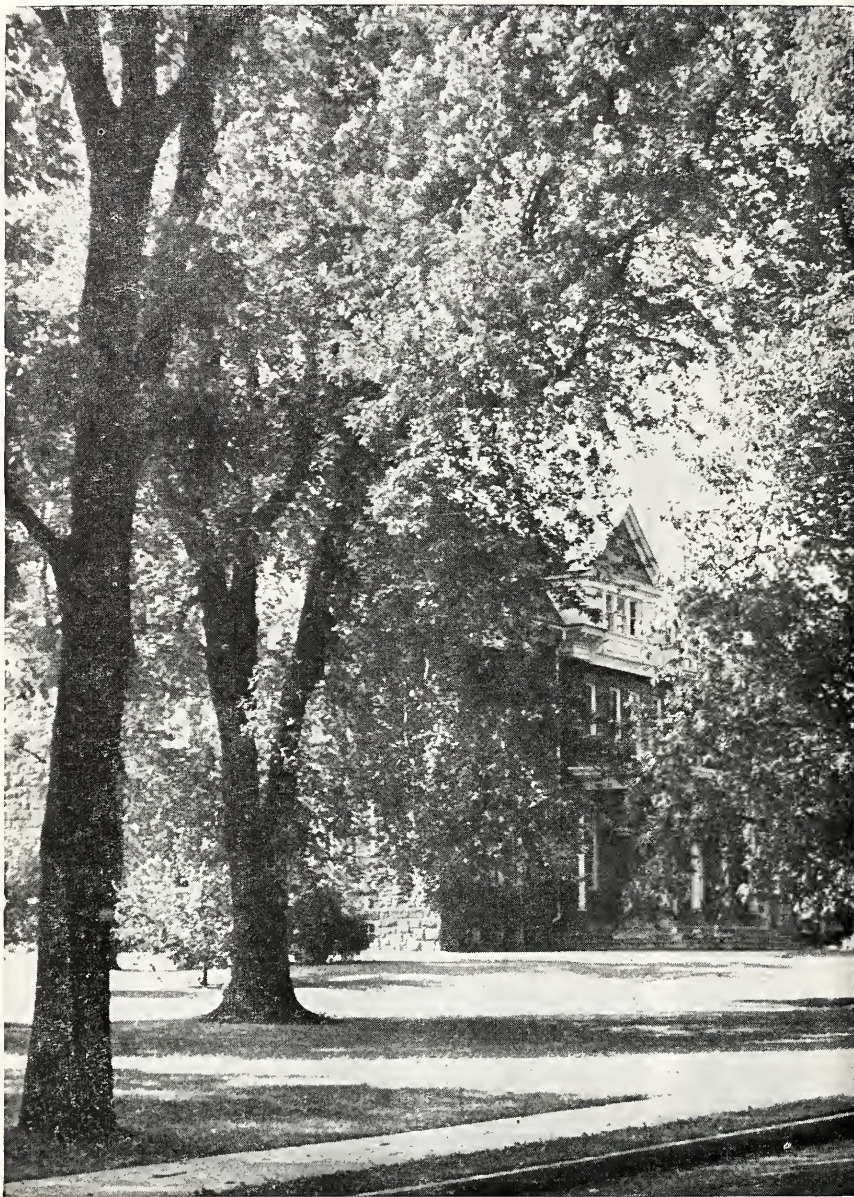
Conservatory of Music