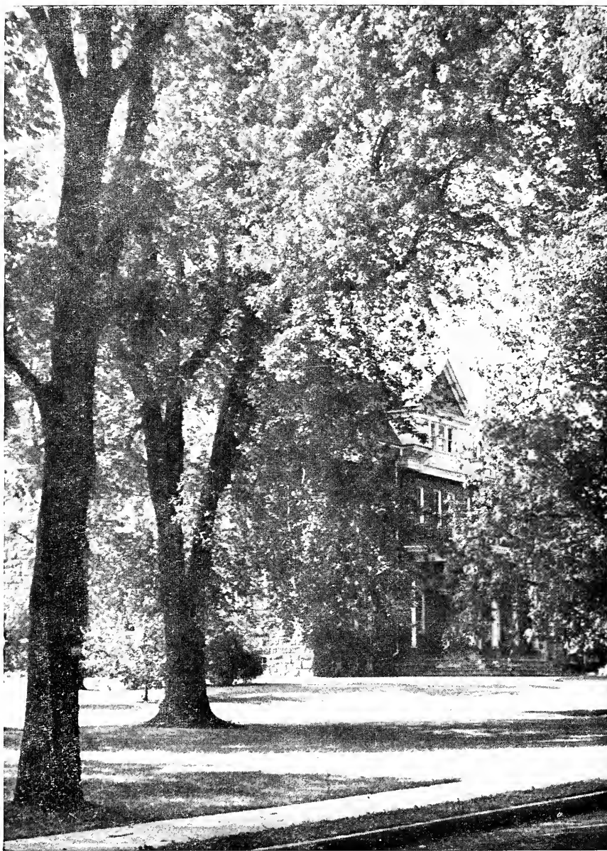
Conservatory of Music