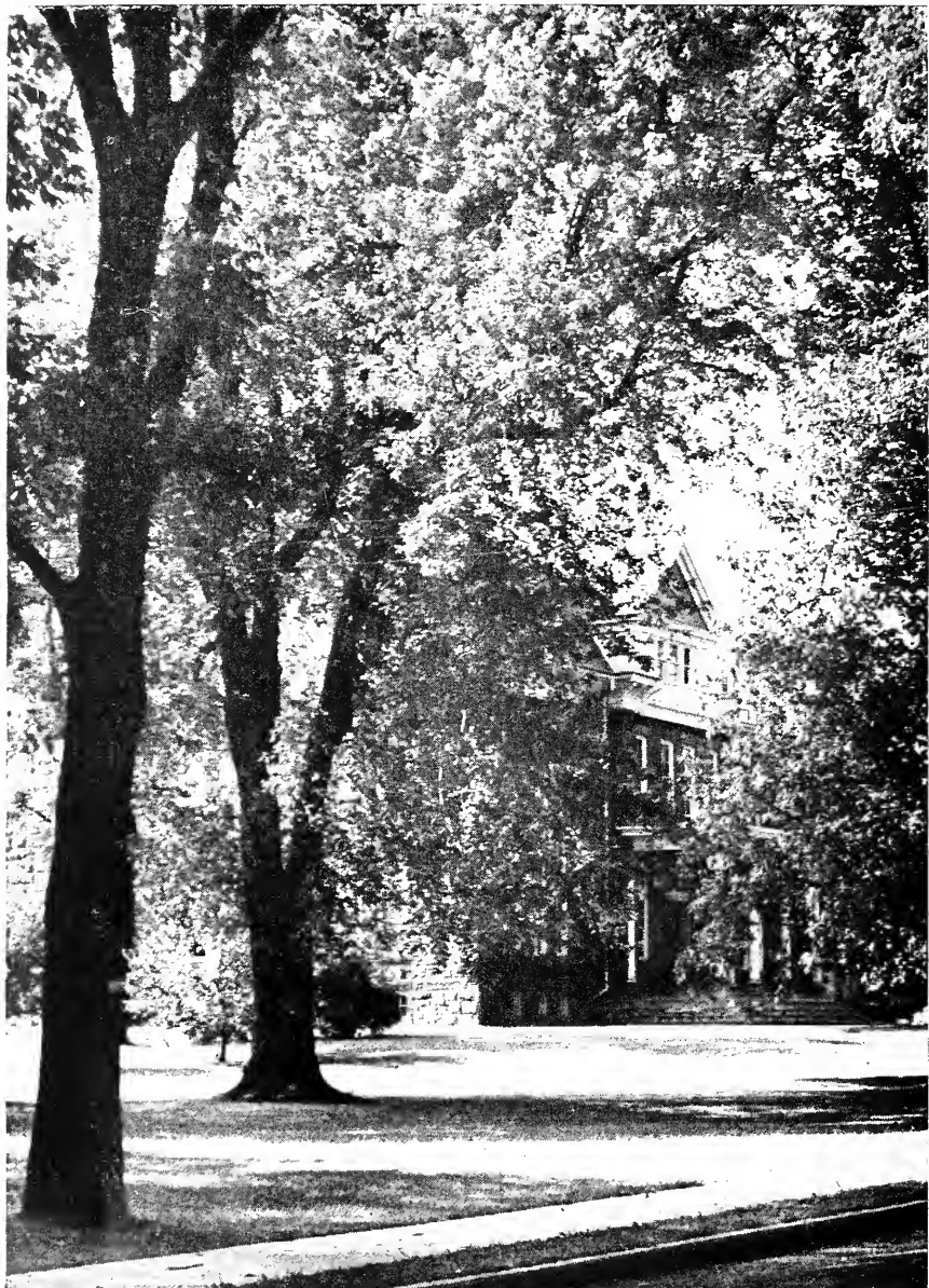
CONSERVATORY OF MUSIC