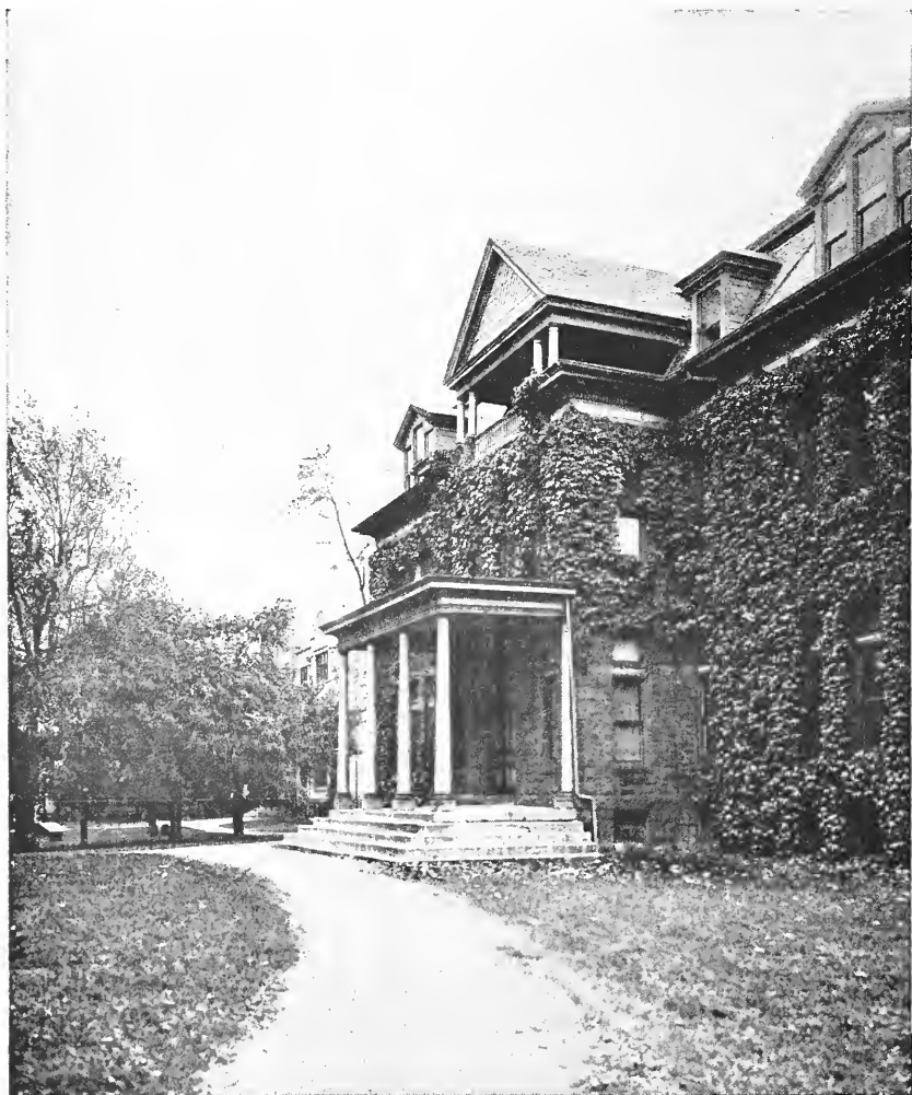
CONSERVATORY OF MUSIC