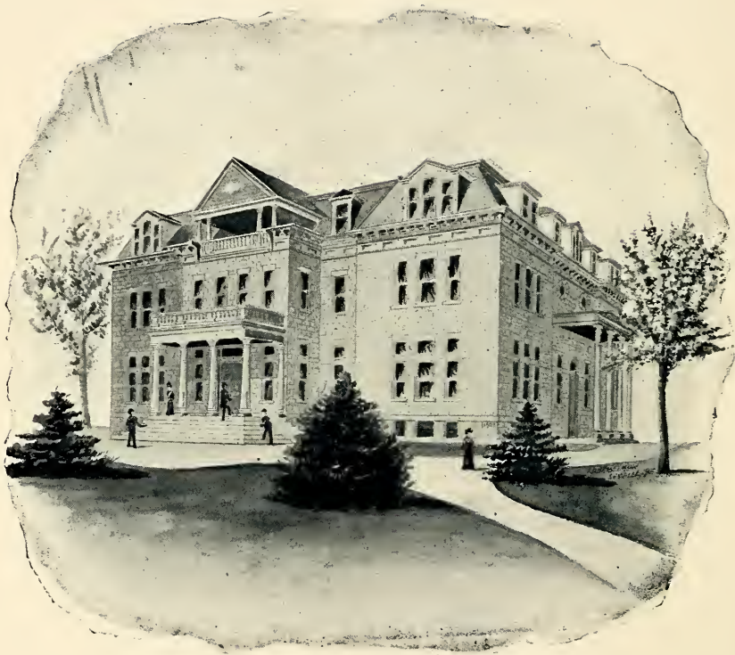
NEW MUSIC HALL.