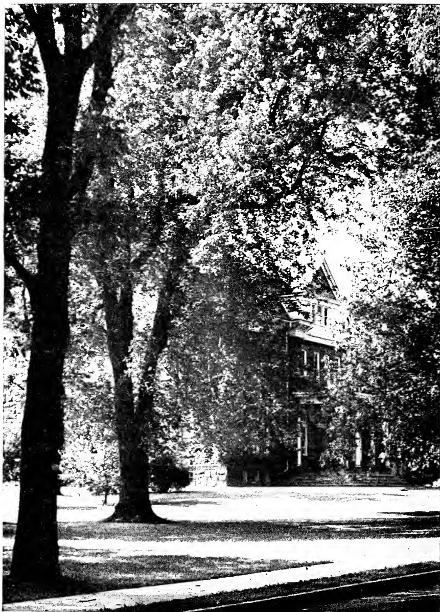
CONSERVATORY OF MUSIC