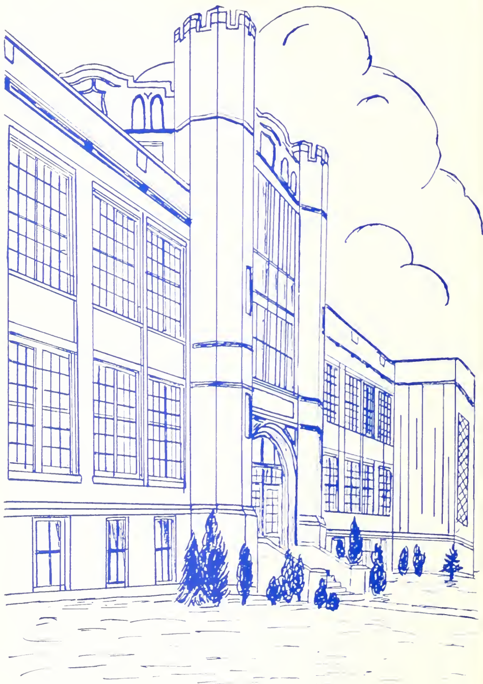
DEMONSTRATION SCHOOL DERRY TOWNSHIP HIGH SCHOOL, HERSHEY, PA.