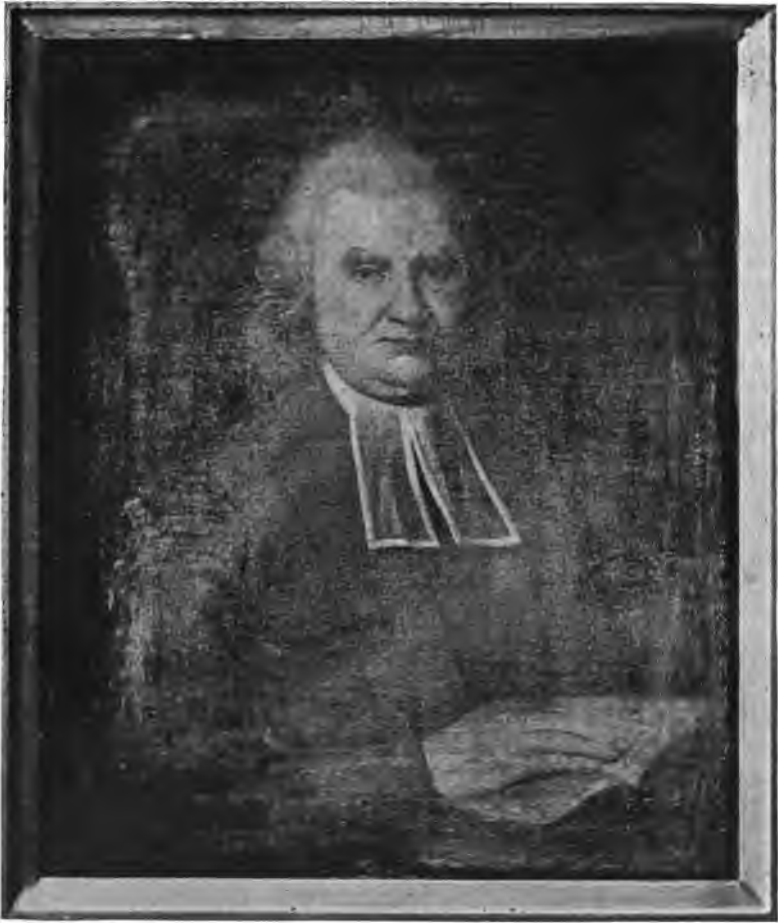
JOHN WITHERSPOON, D.D., LL.D.

[From the painting by Charles Wilson Peale]