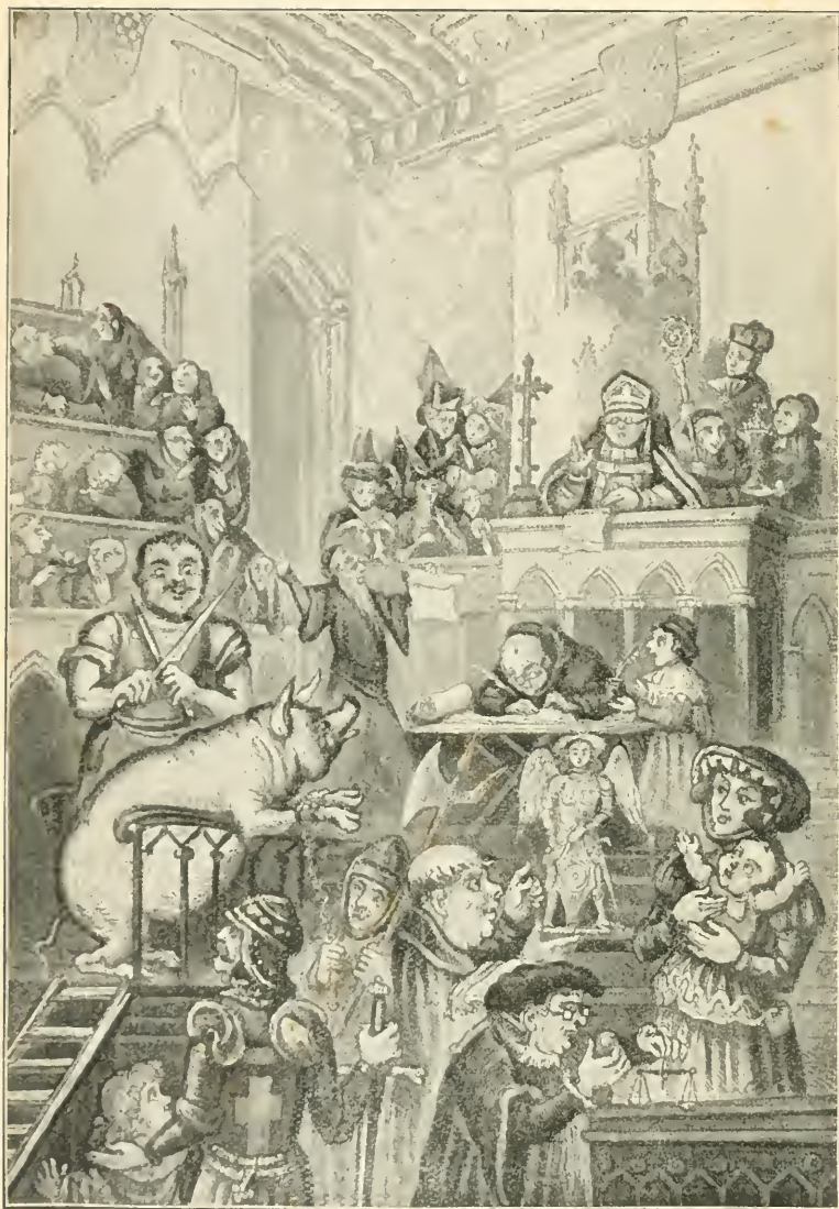
TRIAL OF A PIG AT LAUSANNE IN THE FOURTEENTH CENTURY.