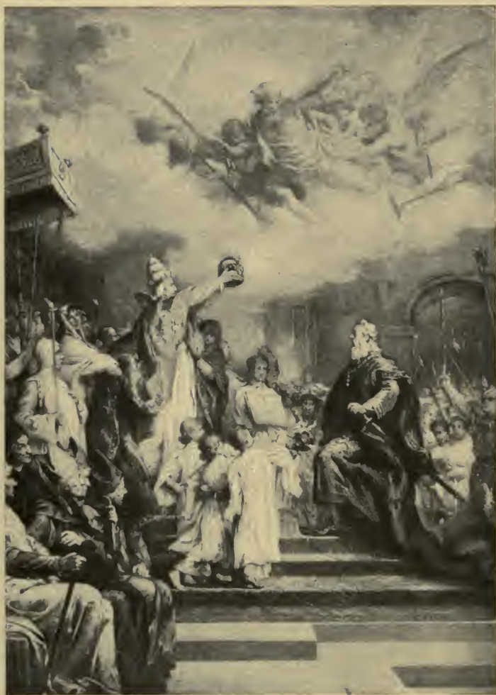
CORONATION OF CHARLEMAGNE.—Lévy.