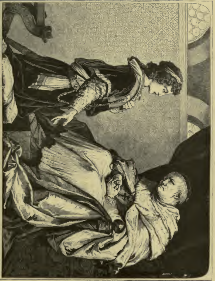
HUON BEFORE THE POPE. — Gabriel Max.