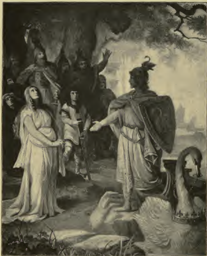
ARRIVAL OF LOHENGRIN. — Pixis.