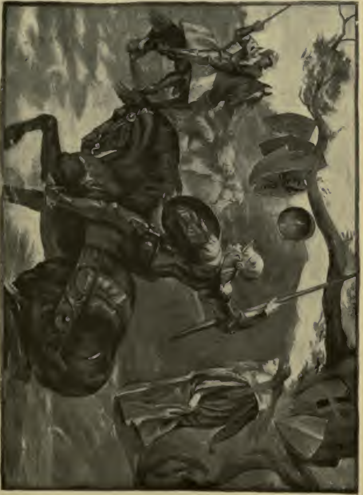
SIR LANCELOT DU LAC.—Sir John Gilbert.