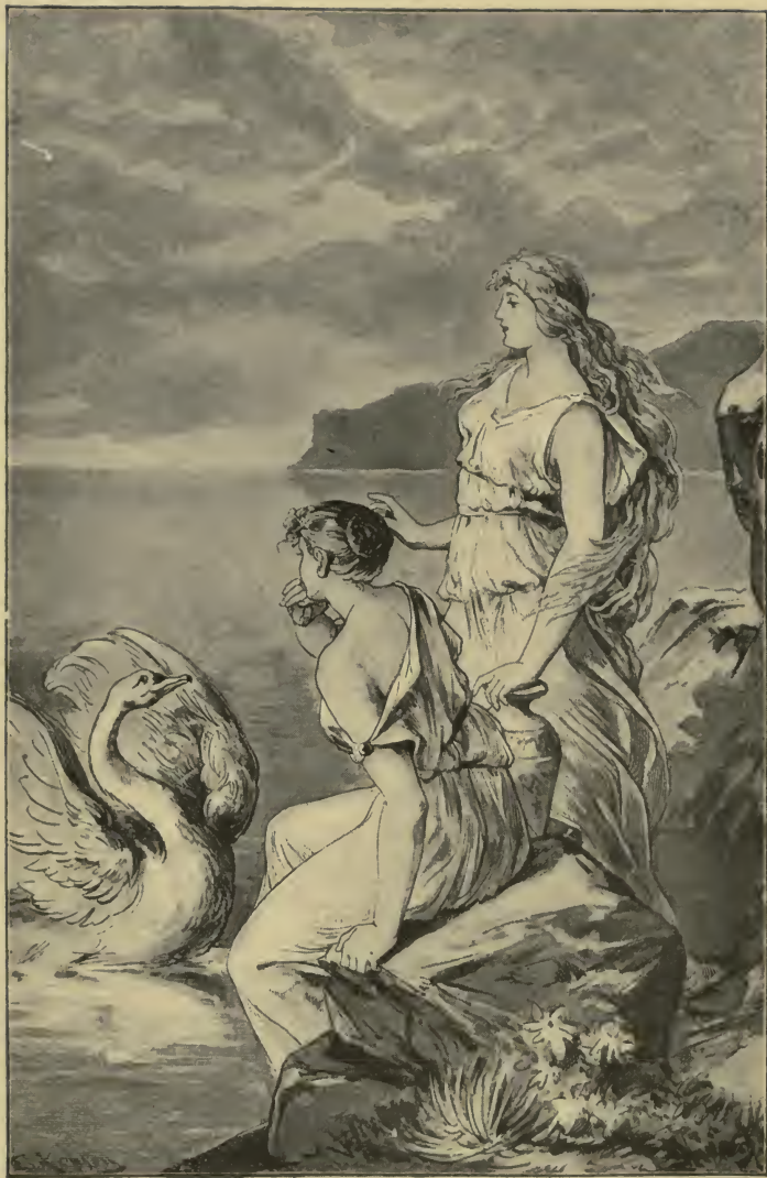
GUDRUN AND THE SWAN.