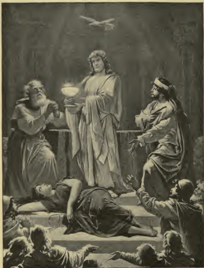
PARZIVAL UNCOVERING THE HOLY GRAIL. — Pixis.