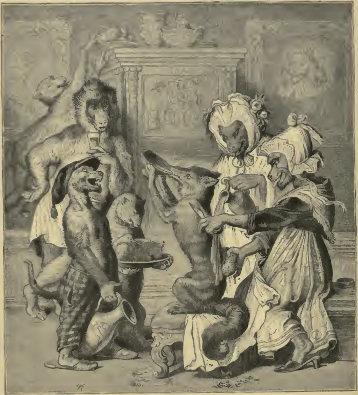
REYNARD PREPARING FOR BATTLE. — Kaulbach.