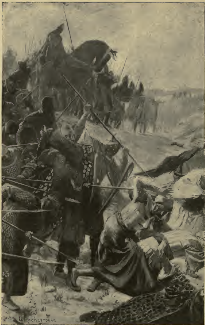
THE CID'S LAST VICTORY. — Rochegrosse.