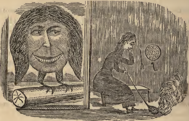
FLYING HEAD AND WOMAN SITTING BY THE FIRE.

I will now relate a few of the monsters that plagued them : The first enemy that appeared to question their power or disturb their peace was the fearful phenomenon of Ko-nea-rah-yah-neh, or the flying heads. The heads were enveloped in beard and hair, flaming like fire ; they were of monstrous size, and shot through the air with the speed of meteors. Human power was not adequate to cope with them. The priests pronounced them a flowing power of some mysterious influence, and it remained with the priests alone to expel them by their magic power.