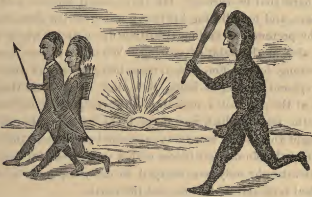
STONISH GIANT CHASING INDIANS.

And they were also invaded by a still more fearful enemy, the Ot-nea-yar-heh, or Stonish Giants. They were a powerful tribe from the wilderness, tall, fierce and hostile, and resistance to them was vain. They defeated and overwhelmed an army which was sent out against them, and put the whole country in fear. These giants were not only of great strength, but they were cannibals, devouring men, women and children in their inroads.