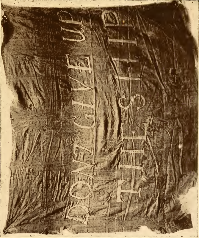
PERRY'S FLAG, SEPTEMBER 10, 1813