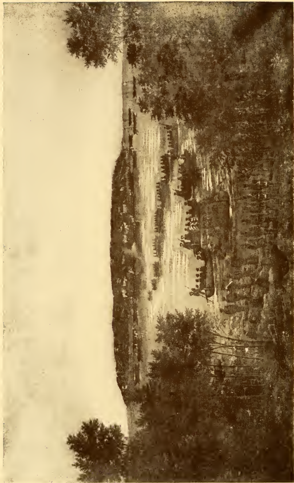
THE BURIAL SCENE By Chevalier