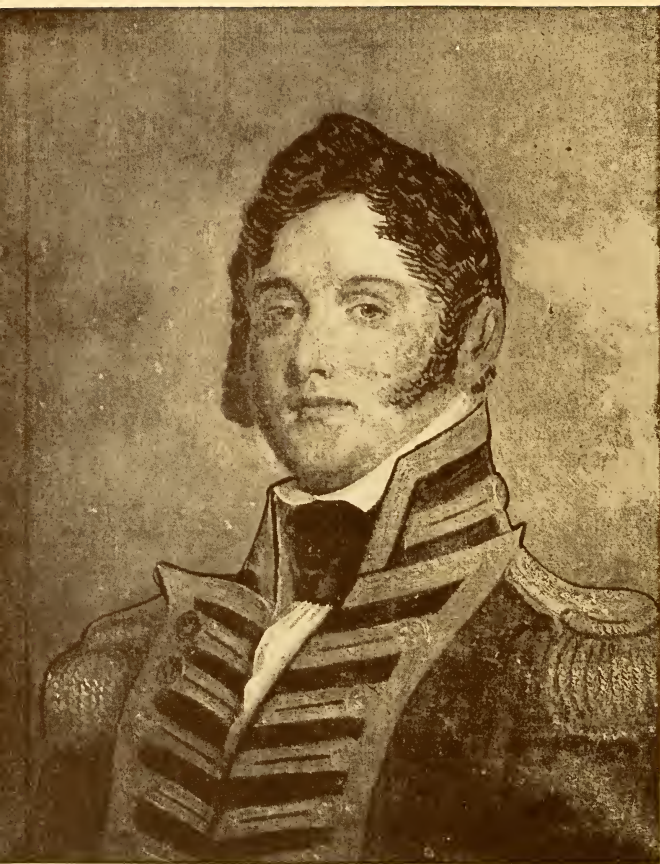
OLIVER HAZARD PERRY