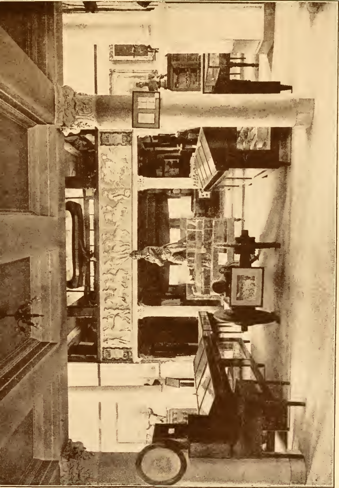
WESTERN RESERVE HISTORICAL SOCIETY MUSEUM, SHOWING PLASTER CAST OF OLIVER HAZARD PERRY