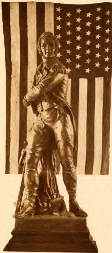
PLASTER CAST OF THE PERRY STATUE By William Walcutt, 1860