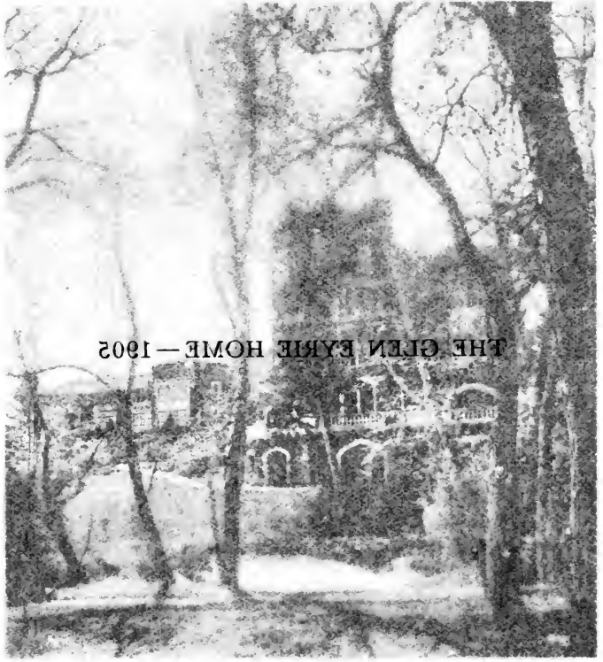
THE GLEN EYRIE HOME — 1902