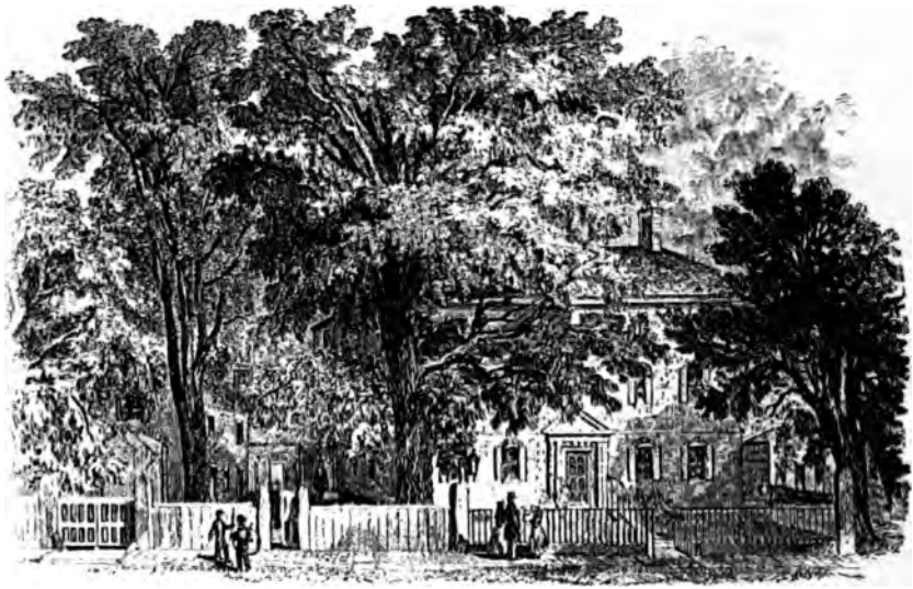
JOHN ROWE'S HOUSE IN POND LANE (Bedford Street)