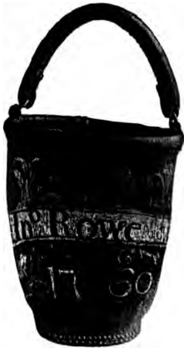
FIRE BUCKET 1760