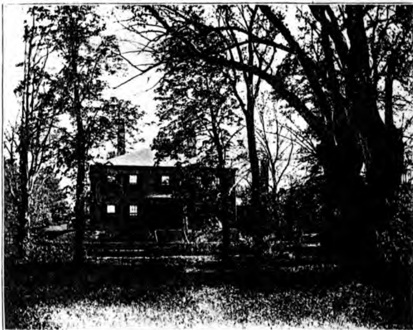
ROWE ESTATE AT MILTON Bought from Gov. Belcher's Heirs in 1781