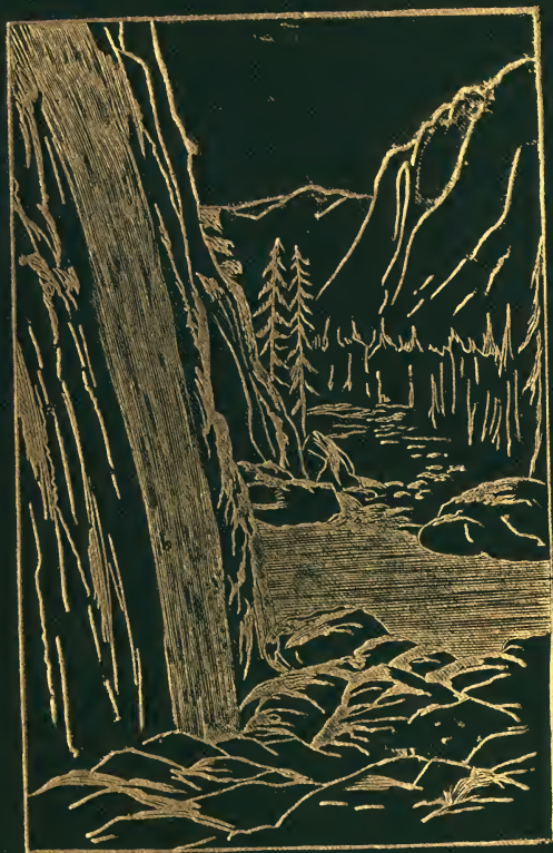
THE LOWER YO-SEMITE FALL.