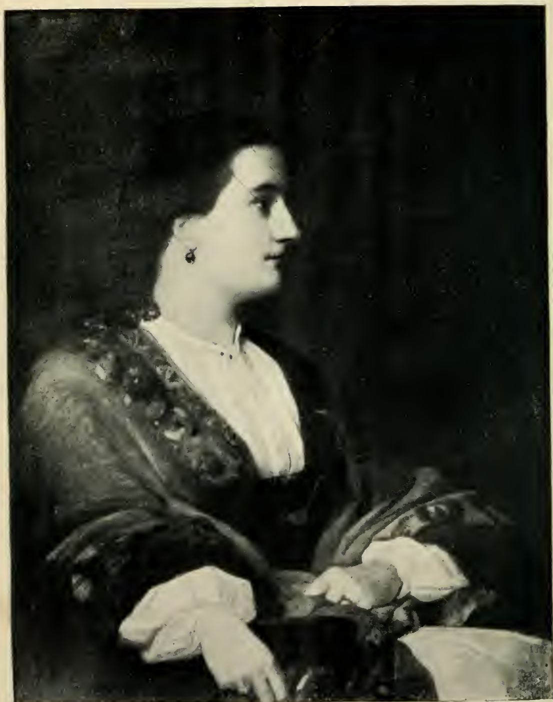
LADY DUFF GORDON.