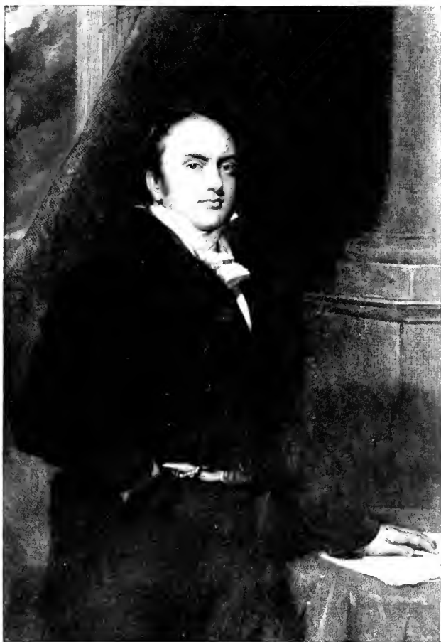
LORD ASHBURTON After Sir T. Lawrence, R. A.