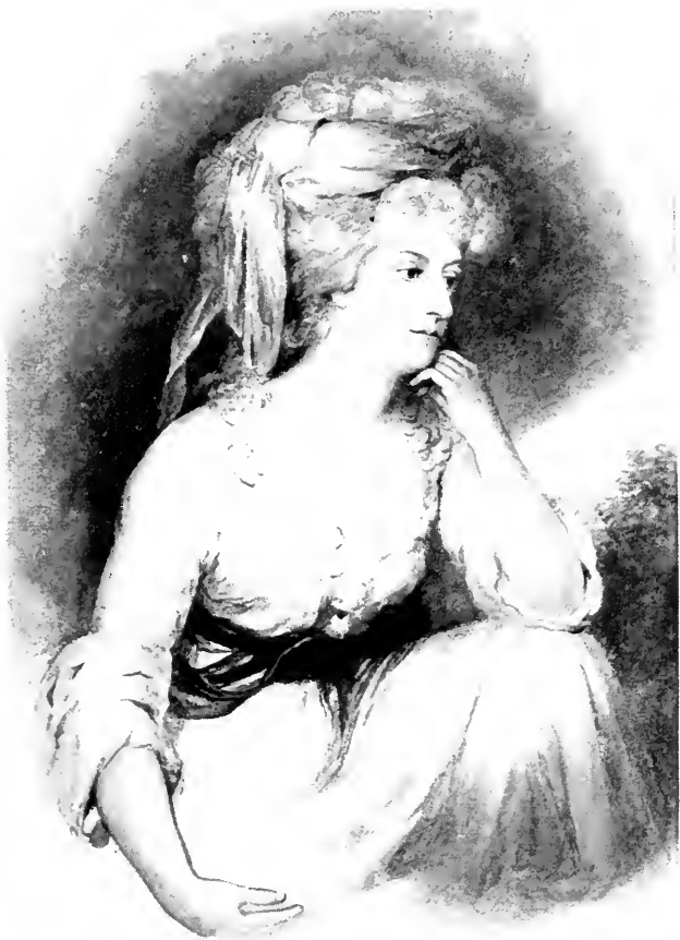
MRS. FITZHERBERT From the pastel by J. Russell