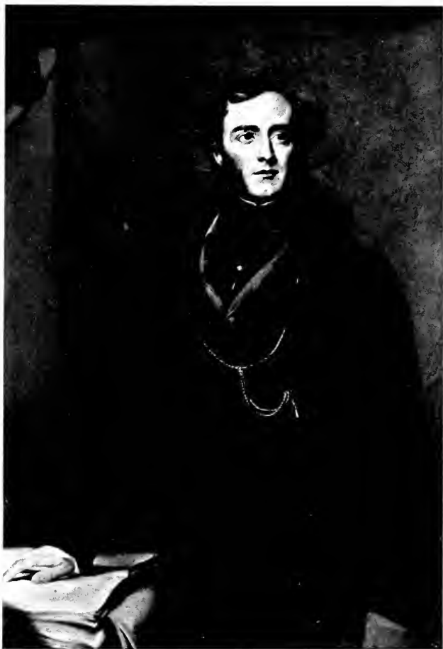
LORD GEORGE BENTINCK

From the picture by Lane, by permission of the Duke of Portland