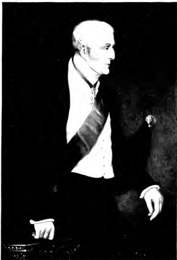
THE DUKE OF WELLINGTON

From the portrait by Count Alfred D'Orsay: photograph copyright by Walker & Cockerell, London