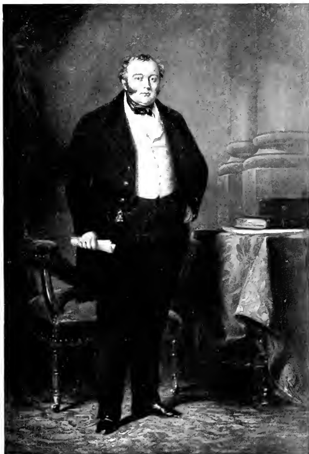
GEORGE HUDSON, THE "RAILWAY KING"