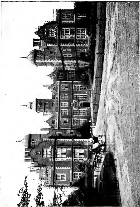
ASTON HALL (BRACEBRIDGE HALL)