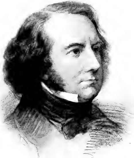
RICHARD MONCKTON MILNES, (LORD HOUGHTON)