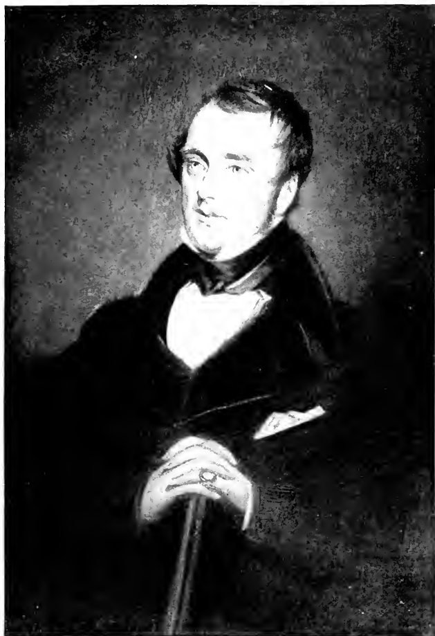
HENRY EDWARD, FOURTH LORD HOLLAND

From the portrait by C. R. Leslie, R. A., at Holland House, by permission of the Earl of Iichester