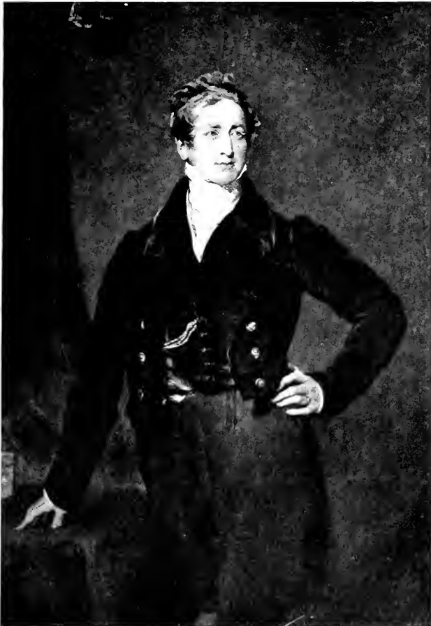
SIR ROBERT PEEL

From the mezzotint after Sir T. Lawrence, R. A.