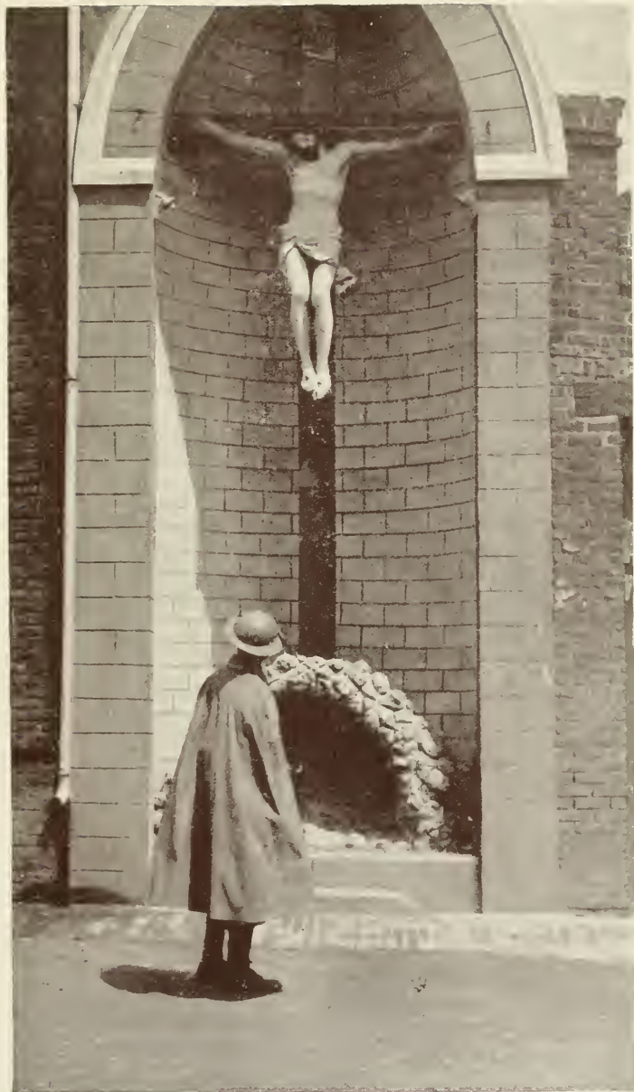
ALONG THE ROAD TO LILLE