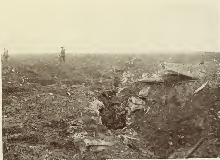
THE BARELY RECOGNISABLE REMAINS OF A TRENCH