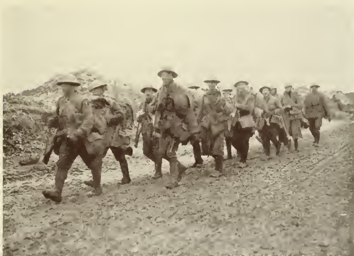
"PAST THE MUD-HEAPS SCRAPPED BY THE ROAD GANGS" ( See p. 192 )