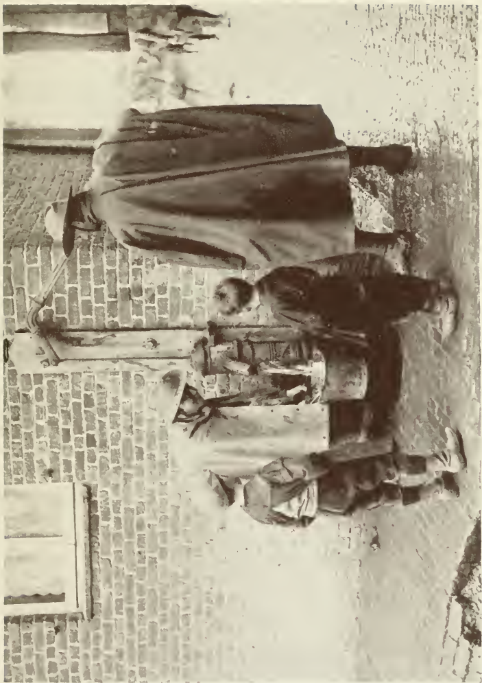
“TALKING WITH THE KIDDIES IN THE STREET”