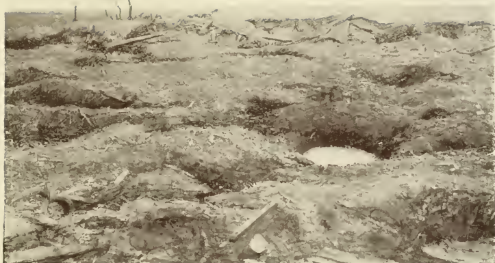
THE TUMBLED HEAP OF BRICKS AND TIMBER WHICH THE WORLD KNOWS AS MOUQUET FARM