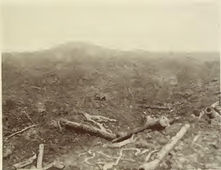
THE WINDMILL OF POZIERES AND THE SHELL-SHATTERED GROUND AROUND IT