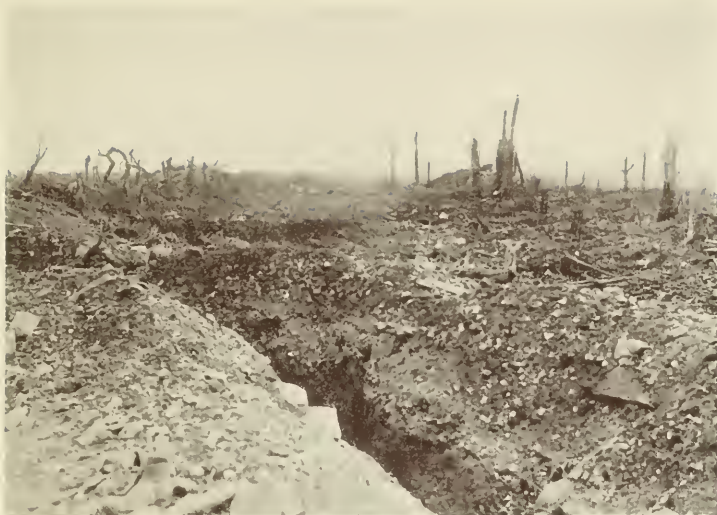
A MAIN STREET OF POZIÈRES IN A QUIET INTERVAL DURING THE FIGHT