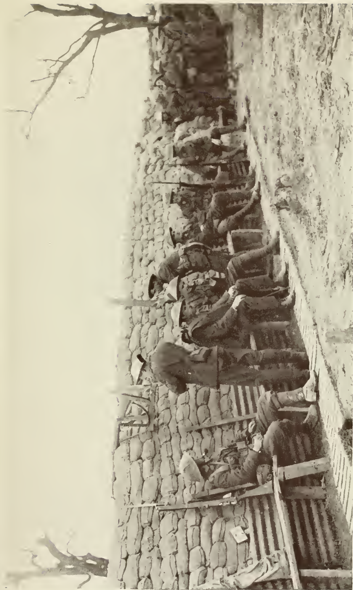
THE TRENCHES HERE HAVE TO BE BUILT ABOVE THE GROUND IN BREASTWORK AND NOT DUG BELOW IT