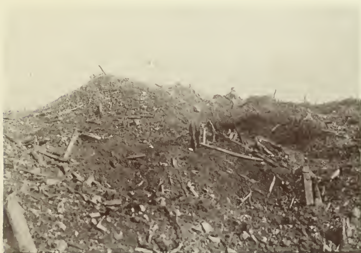
THE CHURCH, POZIÈRES