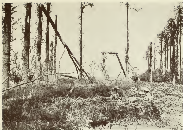
"AN OCCASIONAL BROKEN TREE-TRUNK SNAPPED OFF SHORT, OR BROKEN DOWN AT A SHARP ANGLE, BY SHELL FIRE"