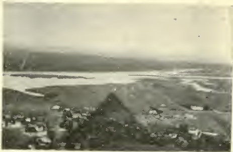
MENA VILLAGE, THE NILE, AND SHADOW OF THE GREAT PYRAMID. (Photo taken from the summit.)