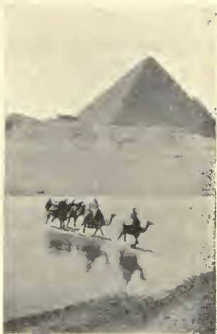
THE CAMELS THAT TOOK US TO SAKKARA.