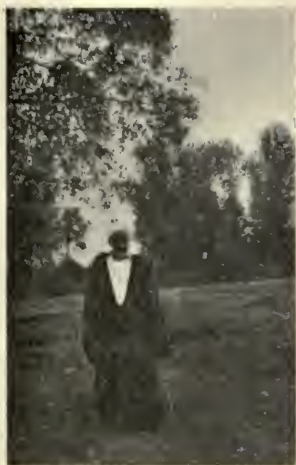
THIS GENTLEMAN INSISTED ON HAVING HIS PHOTO TAKEN. WHY, I DON'T KNOW!