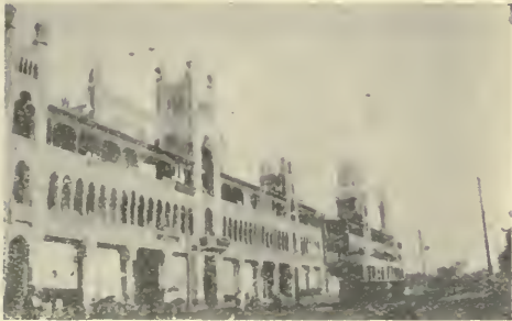
A STREET IN HELIOPOLIS.