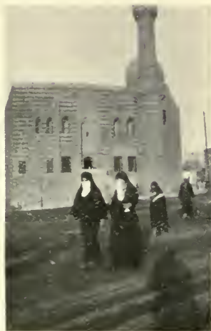
TWO NATIVE LADIES AT MOSQUE EL MAHMUDIYA.