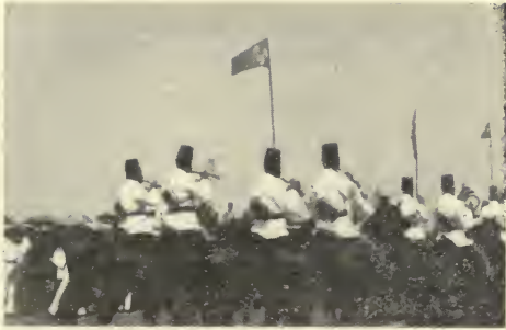
BAND OF EGYPTIAN CAVALRY IN THE PROCESSION.