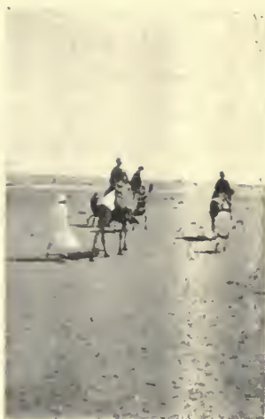
ON THE WAY TO SAKKARA.