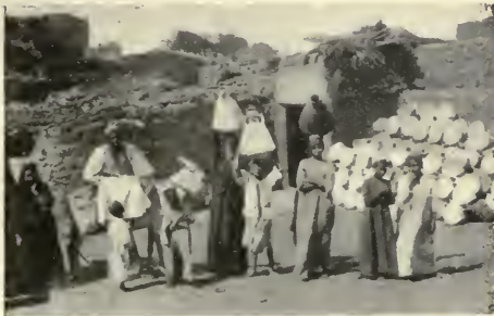
A GROUP AT A NATIVE VILLAGE NEAR CAIRO.