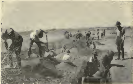
“ B ” COMPANY OR “ THE IDLE RICH. ”