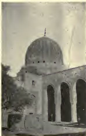
MOSQUE OF SULTAN BARKUK, IN THE TOMBS OF THE KHALIFS.