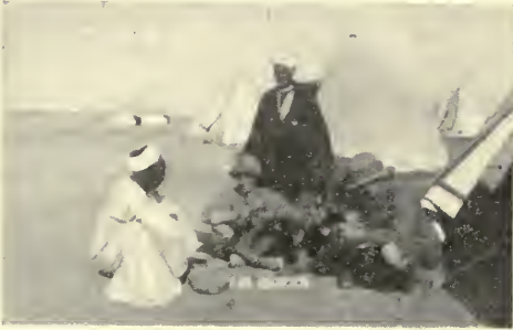
VERA GOOD ! VERA CHEAP !