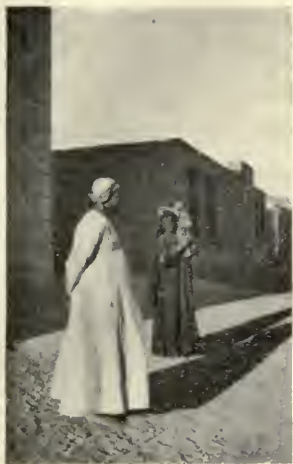
NEAR THE TOMBS OF THE KHALIFS.