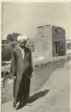
THE "BARBER AND DOCTOR OF HEALTH" AT THE VILLAGE.