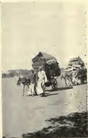
A NATIVE 28TH OF MAY.