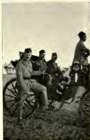
GOING TO CAIRO.