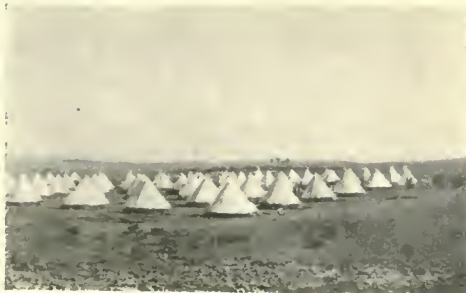
OUR FIRST CAMP AFTER WE LANDED AT MERSA MATRUH.