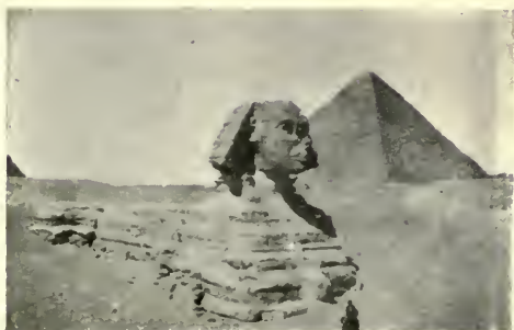
SPHINX AND PYRAMID OF CHEOPS.