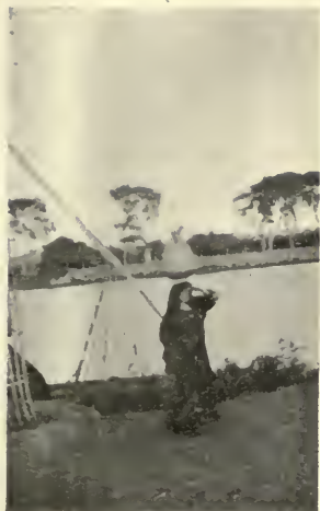
EGYPTIAN WOMAN CARRYING EARTHENWARE WATERPOT.