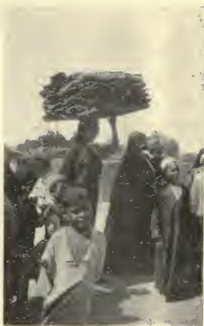
NATIVE GIRL CARRYING HER USUAL LOAD.