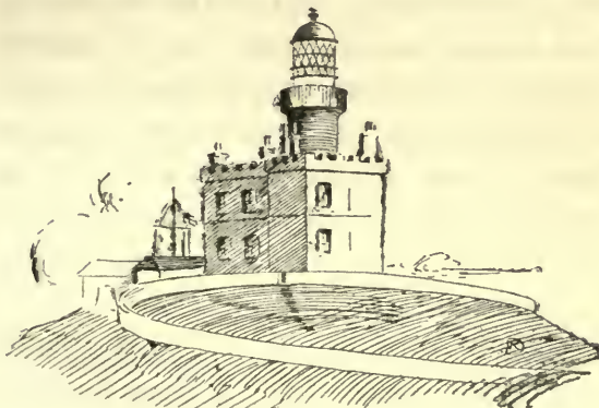
The Inchkeith Lighthouse.

Many thanks for your letter. I have been across to the Mainland to-day paying some men who are on duty at Leith Docks, but I hadn't time to go home. Everything seems very quiet here to-night, but we had a wind last night, the like of which I have never experienced before, and don't want to again. A whole lot of kit bags, boxes, &c., were blown into the sea.