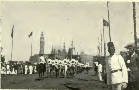
PART OF THE PROCESSION.