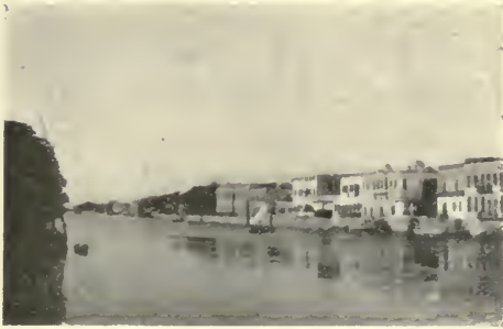
ON THE NILE.