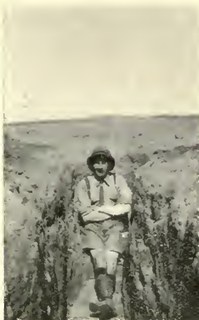
MY LITTLE GREY HOME IN THE EAST