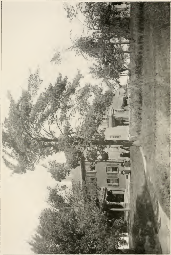
The Fairfield Homestead, Saco