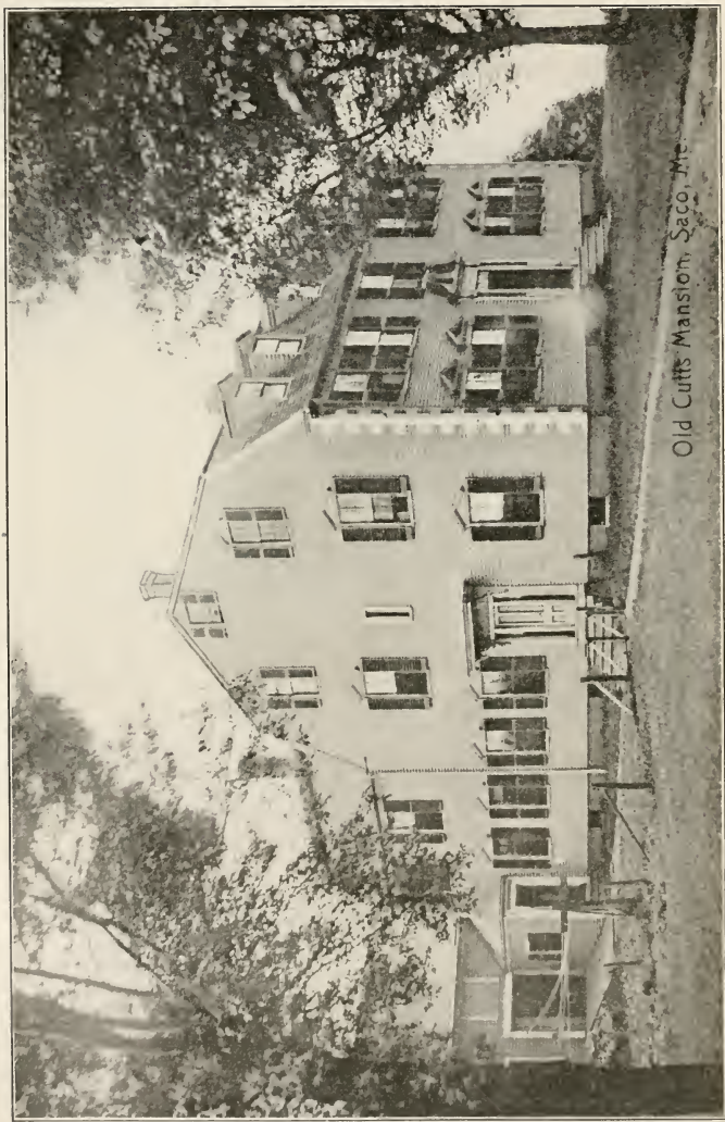
Old Cutts Mansion, Saco, Me.