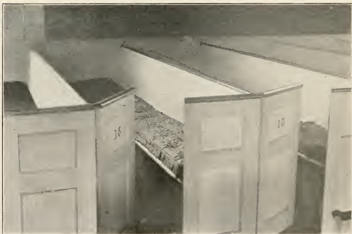
THE FAIRFIELD PEW in Unitarian Church, Saco