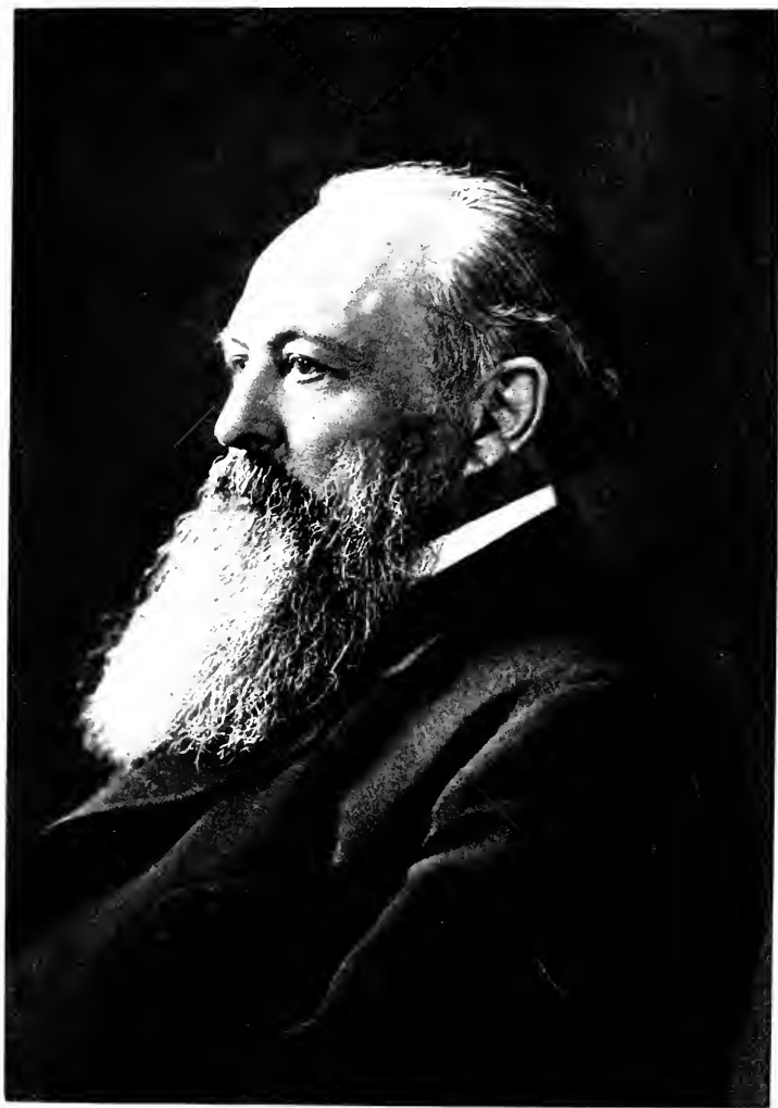
Very truly yours Docton