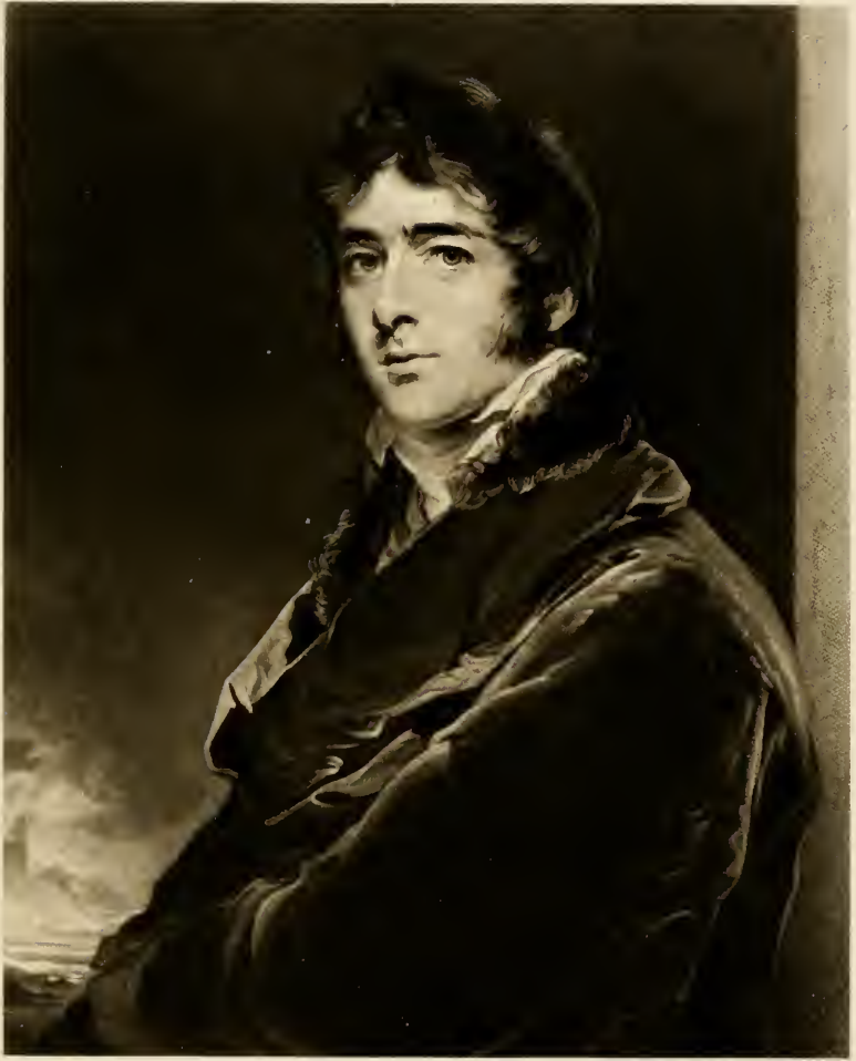
Viscount Melbourne After Sir T. Lawrence P. R. A.