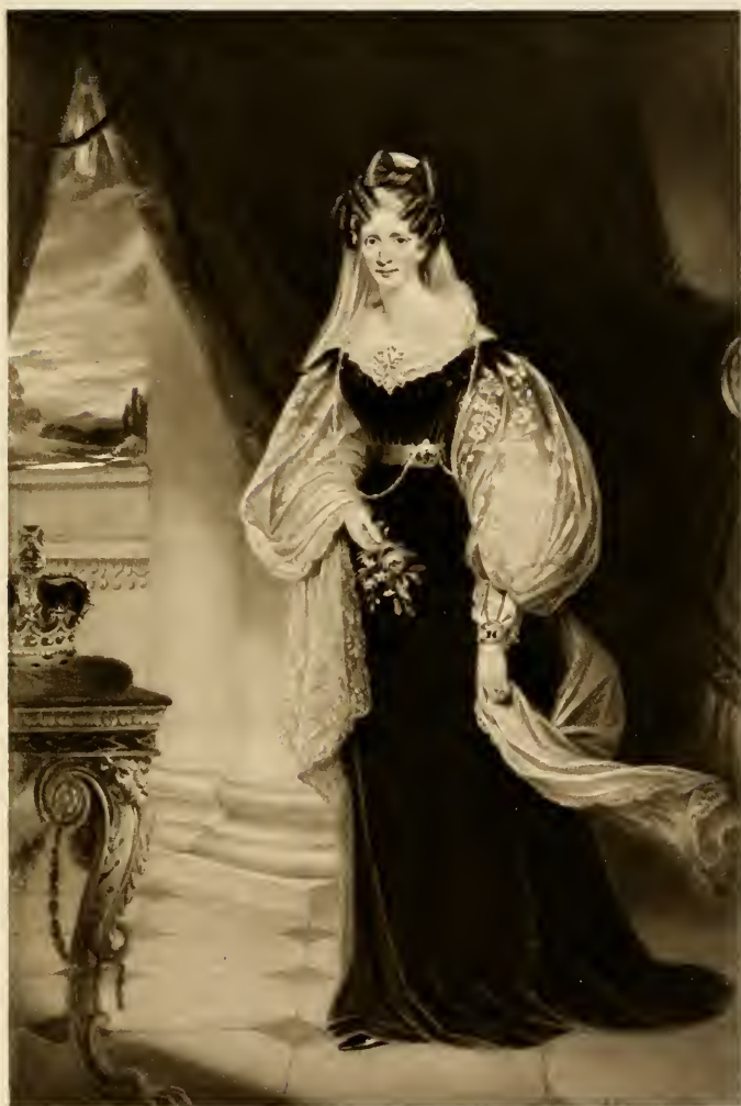
H. M. Queen Adelaide 1832