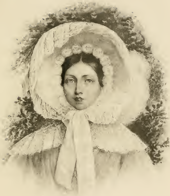
H. H. Queen Victoria 1841