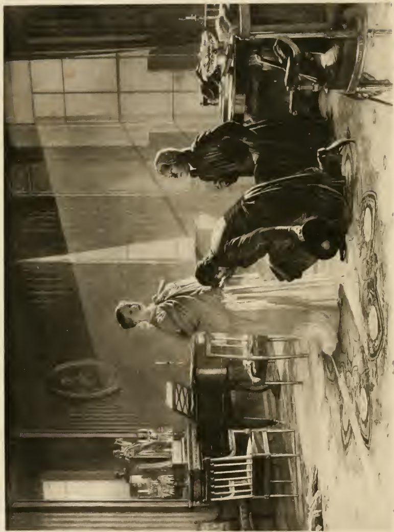
Queen Victoria receiving the news of her Accession to the Throne June 20, 1837 from the picture by H. M. A. R. A. at Buckingham Palace.