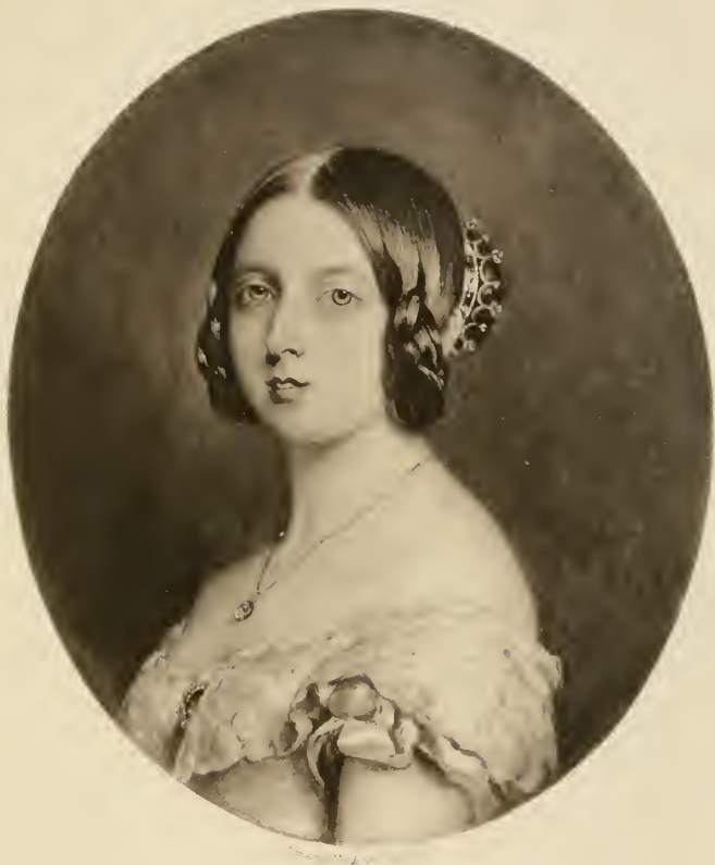
H. M. Queen Victoria 1842 By Essex after Winterhalter From the miniature at Buckingham Palace