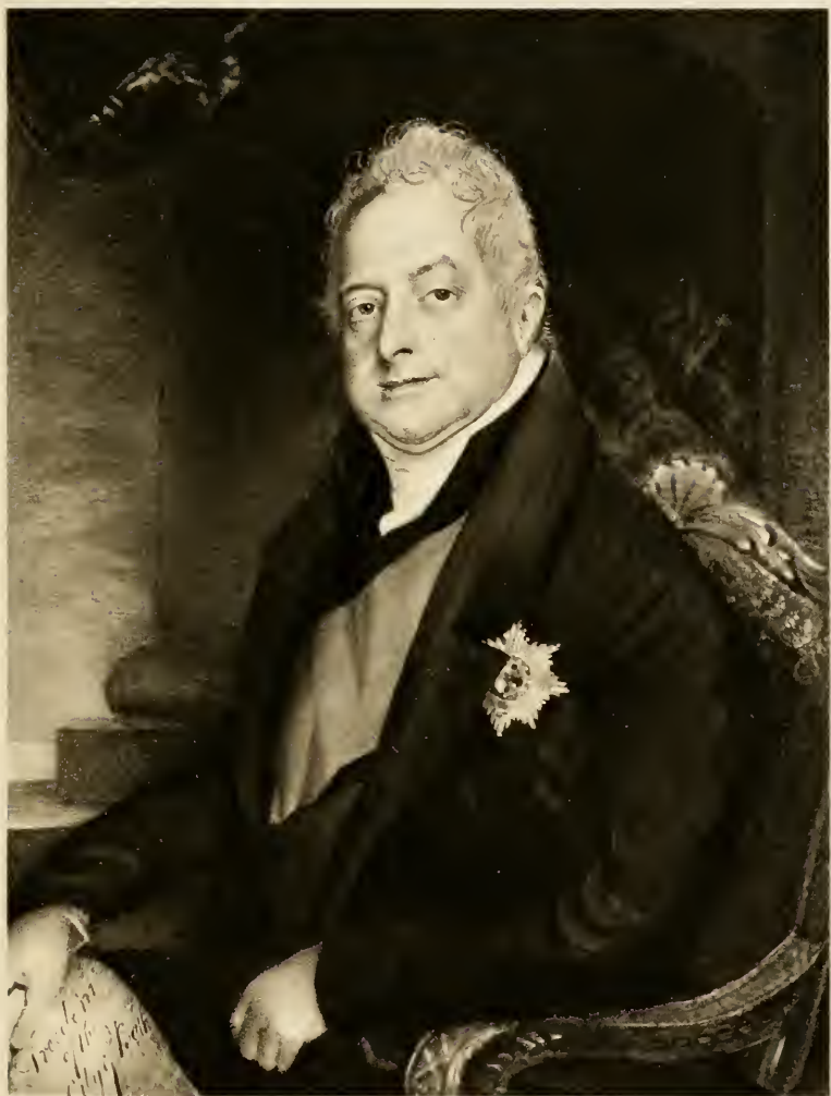
H. M. King William IV From the miniature at Windsor Castle