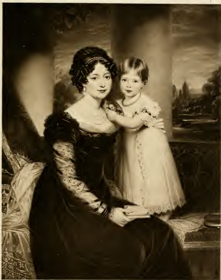
J. R. H. The Duchess of Kent and Princess Victoria From the miniature at Windsor Castle by H. Bone after Sir W. Beechey