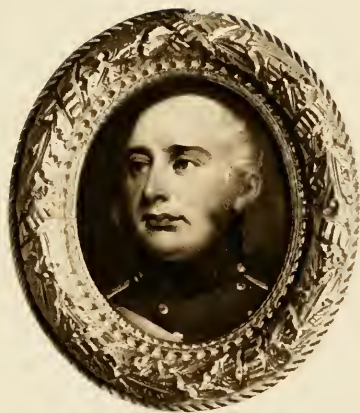
H. R. H. The Duke of Kent From the miniature at Windsor Castle