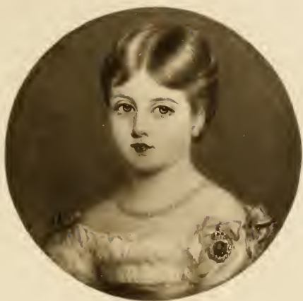
H.R.H. Princess Victoria 1827

By Plant after Stewart From the miniature at Buckingham Palace.