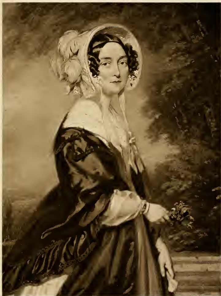
H. R. H. The Duchess of Kent 1841