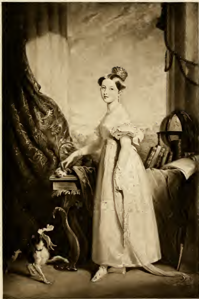
H. P. H. Princess Victoria 1833

From the picture after Sir G. Hayter at Windsor Castle