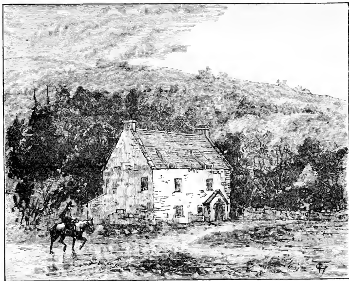
BUSH O' BEILD—RUTHERFORD'S HOUSE.

BY THE REV. ANDREW A. BONAR, D.D. AUTHOR OF 'MEMOIR AND REMAINS OF ROBERT MURRAY M'CHEYNE'