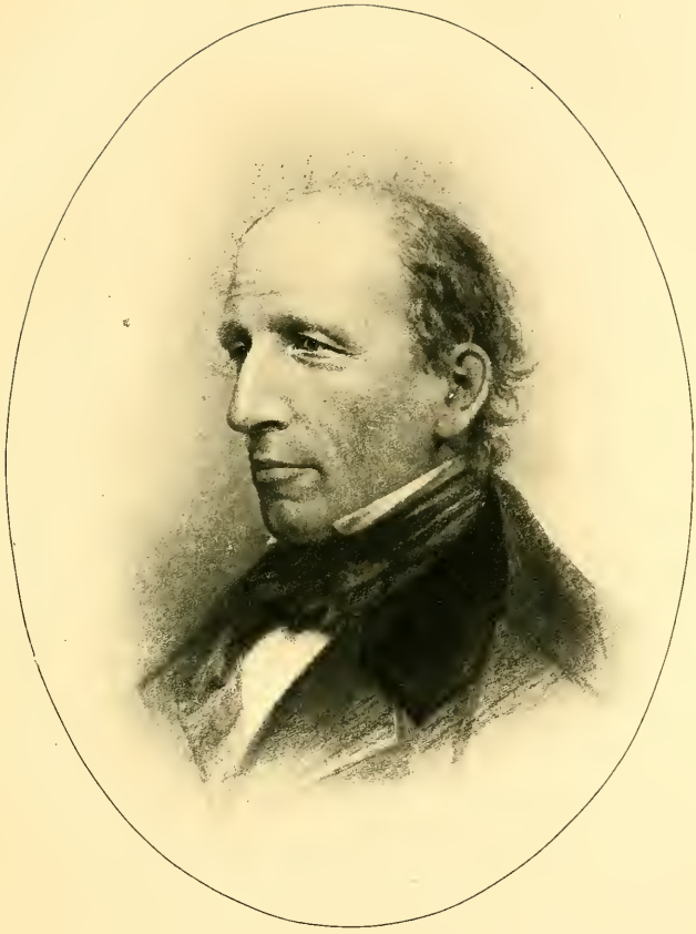
From a Crayon by Cheney about 1851