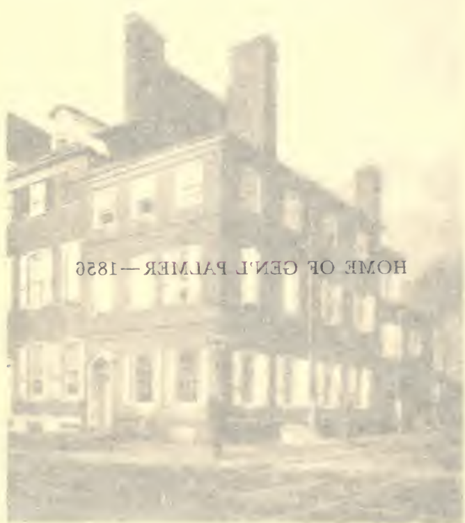
HOME OF GENL PALMER—1850