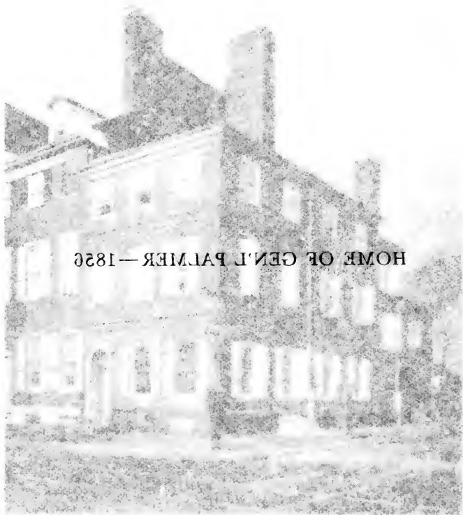
HOME OF GENL PALMER—1850