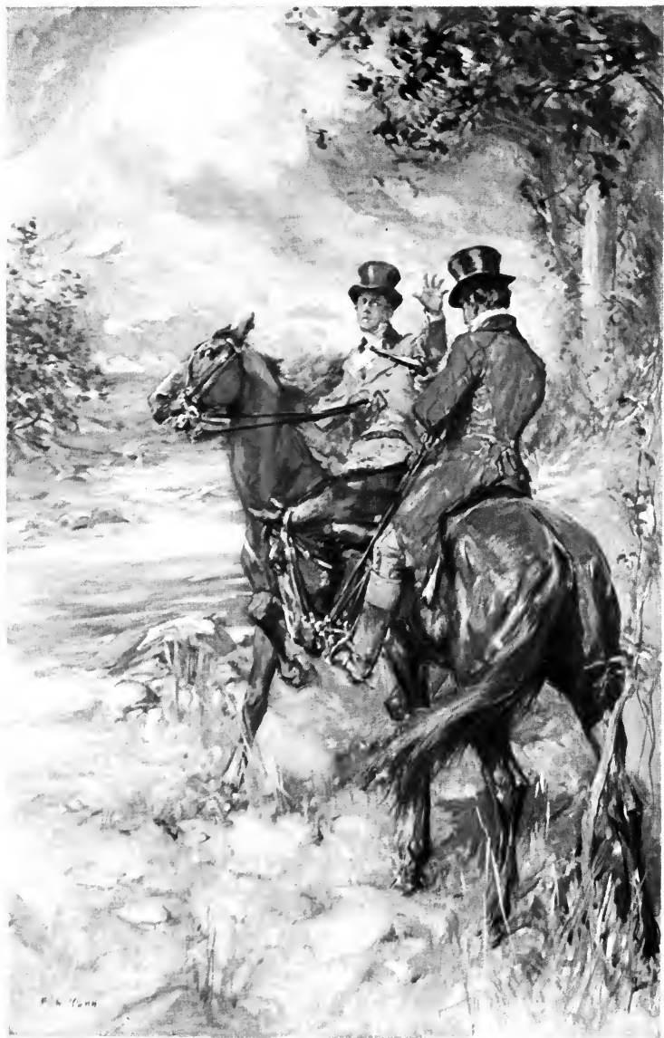
CARY SAW AND FLUNG OUT HIS ARM, SWERVING HIS HORSE, BUT TOO LATE