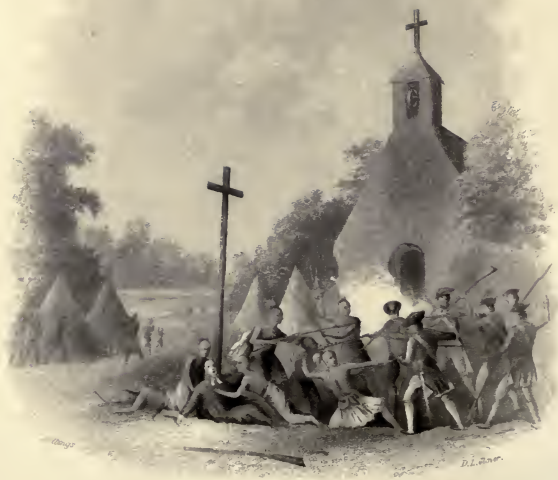
THE DEATH OF FATHER RALE