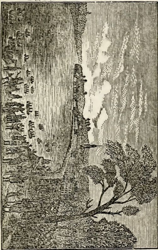
COUNCIL GROUND AT PRAIRIE DU CHIENS.