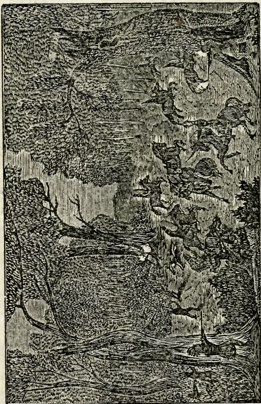
BATTLE OF SYCAMORE CREEK.