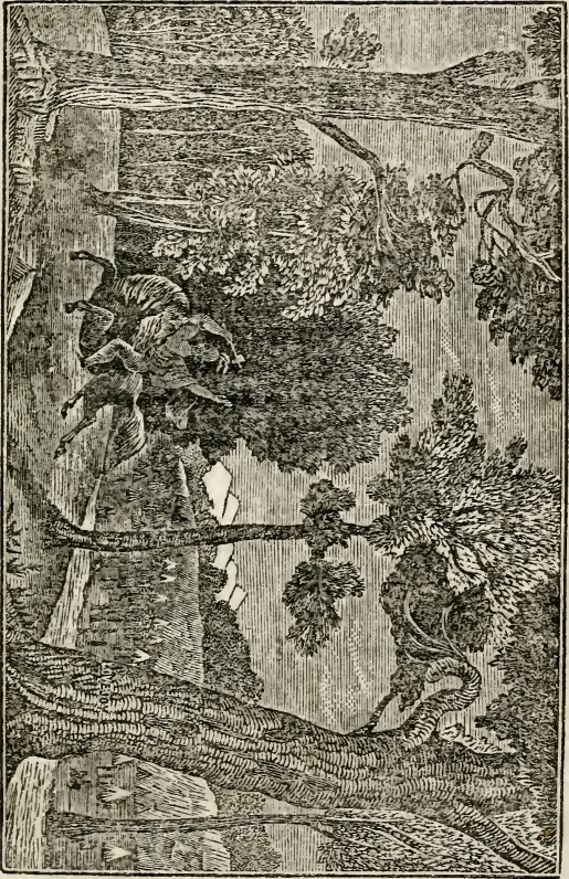
KEOKUK LEAVING THE SIOUX ENCAMPMENT.