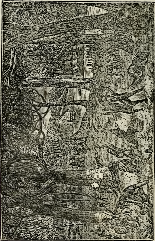
BATTLE OF BAD-AXE.