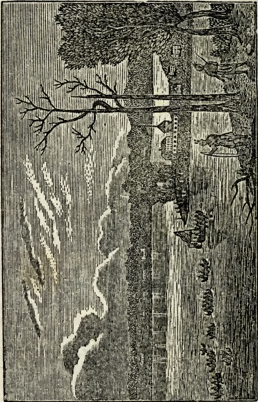
TREATY AT FORT ARMSTRONG.