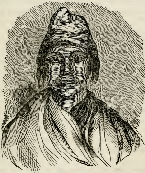
WABOKIESHIEK, THE PROPHET.