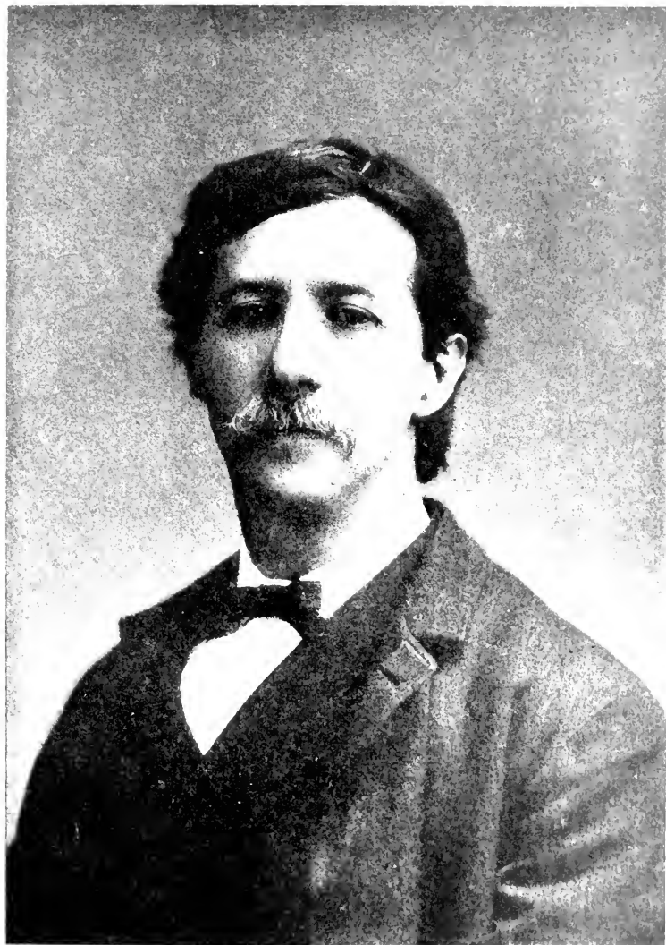
AUGUSTIN DALY IN 1892