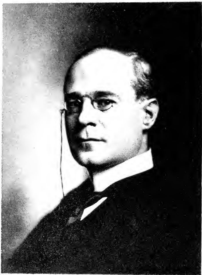
Richard Mansfield