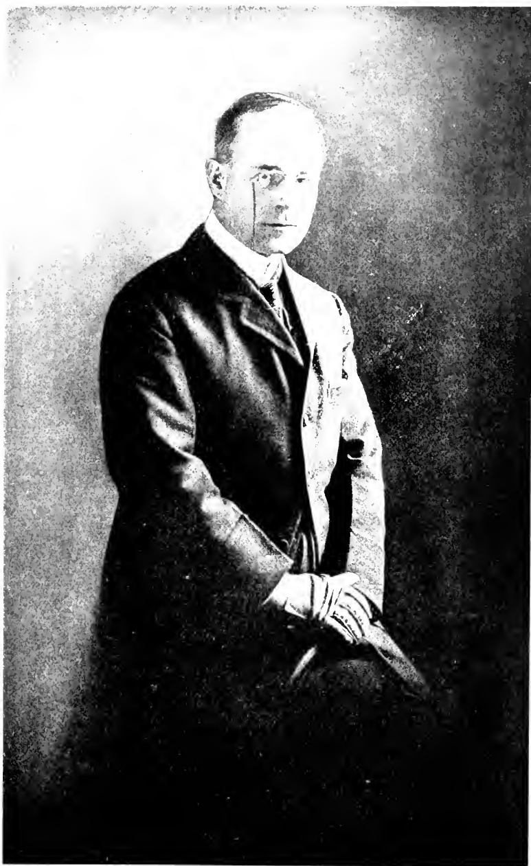
RICHARD MANSFIELD IN 1905