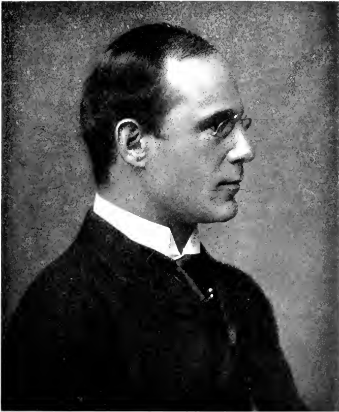
RICHARD MANSFIELD IN 1889

"Look with a gentle eye upon this wretch"