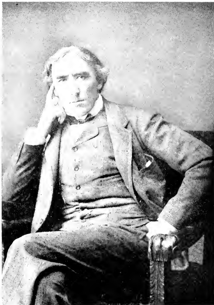
HENRY IRVING IN 1888