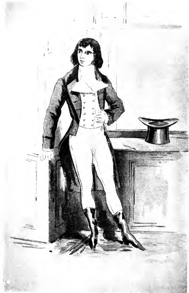
GEORGE BRUMMELL, THE FAMOUS BEAU, IN YOUTH