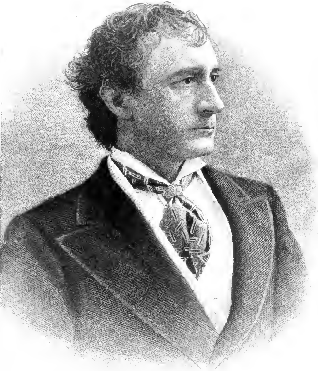
EDWIN BOOTH IN 1883