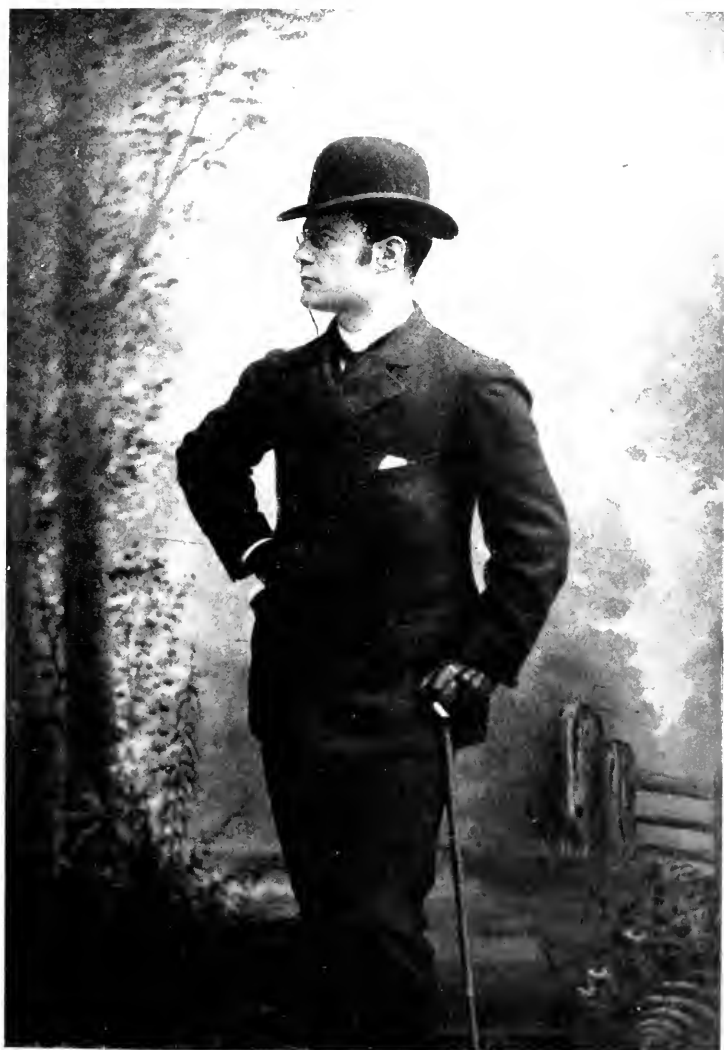
RICHARD MANSFIELD IN 1885