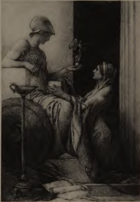
LELAND • STANFORD • JUNIOR • UNIVERSITY