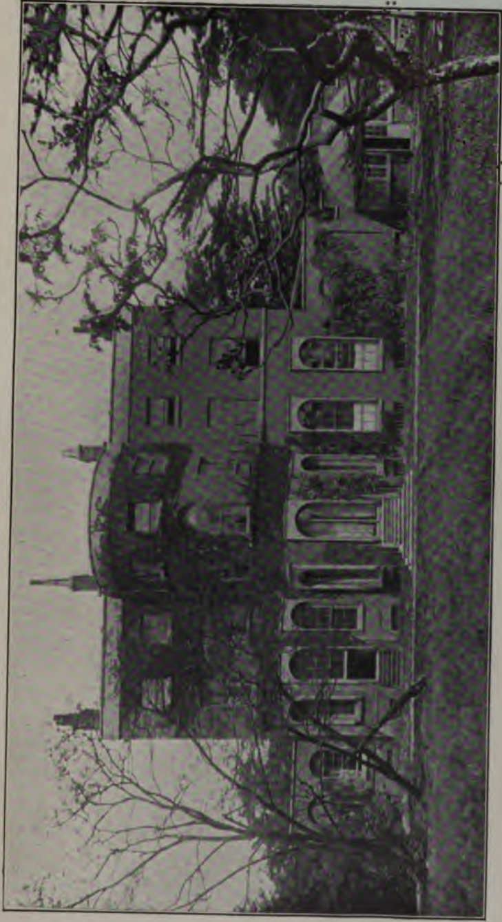
GRANT'S HOUSE AT CLAPHAM (NOW CARLYLE COLLEGE),