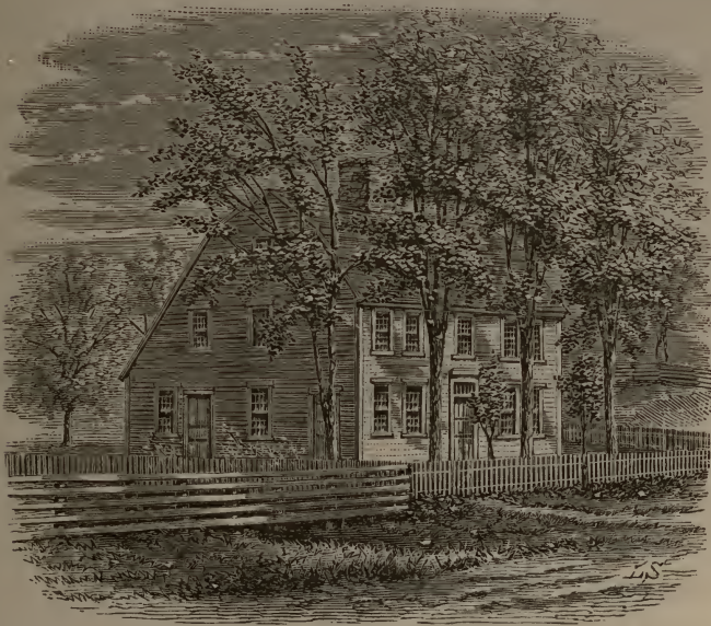
House in which Dr. Seabury was chosen Bishop.

Fourteen clergymen were to be found in Connecticut at the close of the war. They were ministering in some way to their feeble and impoverished flocks, and in the last week of March, 1783, ten of this number met in the quiet village of Woodbury, at the house