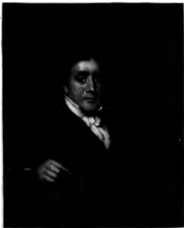
ENGRAVED BY J. SARDON.