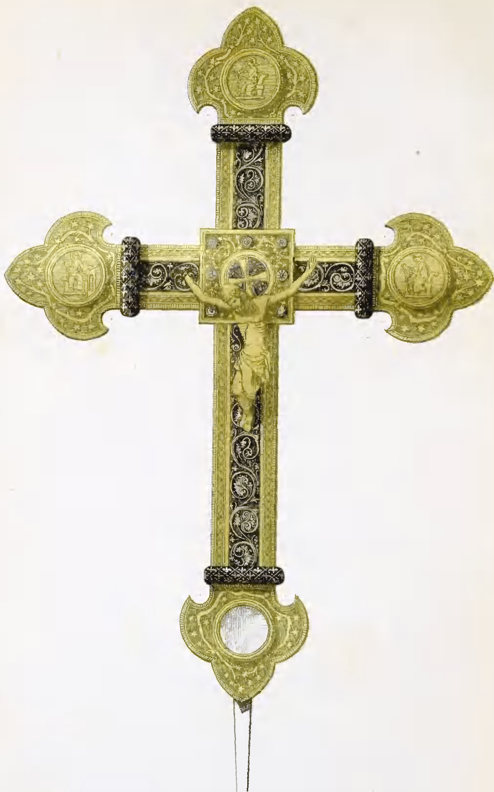
CROSS OF BOUSBECQUE.