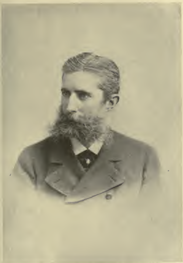
STEDMAN IN 1879