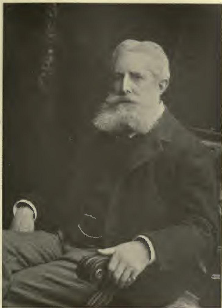
STEDMAN IN 1897