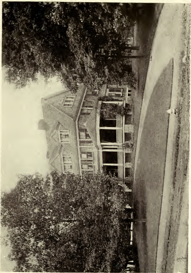
MABIE'S HOME IN SUMMIT