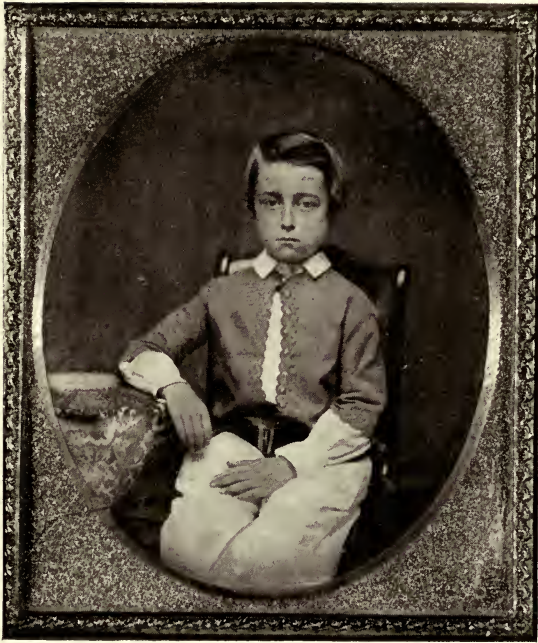
AS A BOY OF EIGHT