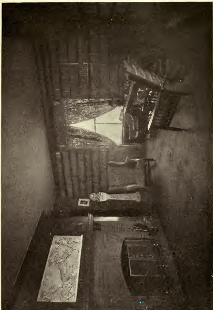
THE LIBRARY IN MABIE'S SUMMIT HOME