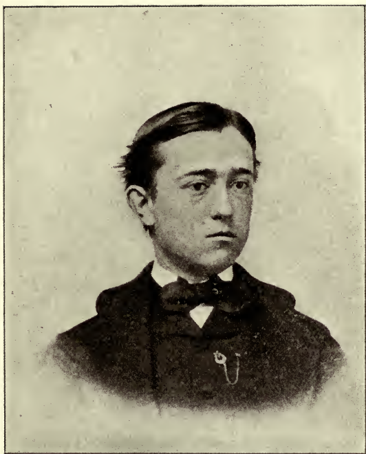
AS AN UNDERGRADUATE AT WILLIAMS